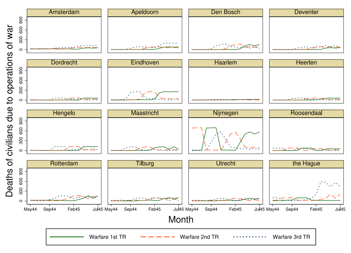
Fig. 3. Civilian deaths due to war operations during pregnancy for each trimester by month of birth and city. Note: Results for those born between May 1944 and July 1945 (month of birth displayed on the horizontal axis). The cities of Alkmaar, Almelo, Amersfoort, Bergen op Zoom, Bussum, Delft, Gouda, Groningen, Helmond, Kerkrade, Leiden, Zaandam, and Zwolle had little variation and are not shown here.

descriptive statistics of these additional data merged with the recruits sample. ^{21}