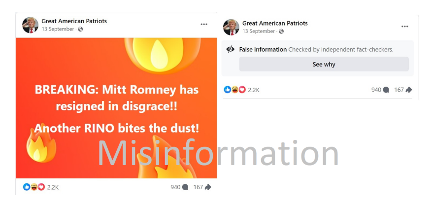
Figure 1: Example of a misinformation post by a partisan page and the fact-checked label on Facebook.

These examples helpfully raise our question of whether demonstrable falsehoods uttered by politicians deserve different treatment from demonstrable falsehoods uttered by ordinary citizens.<sup>4</sup>