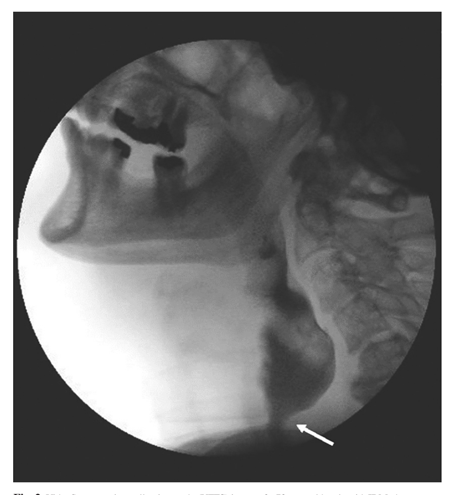
Fig. 2. Videofluoroscopic swallowing study (VFFS) image of a 73-year-old male with IBM, demonstrating prominence of the cricopharyngeal (CP) muscle during swallowing (shown by annotated arrow).

real-time MRI (RT-MRI) performed in 20 IBM patients demonstrated mean laryngeal elevation to be within normal limits (36).