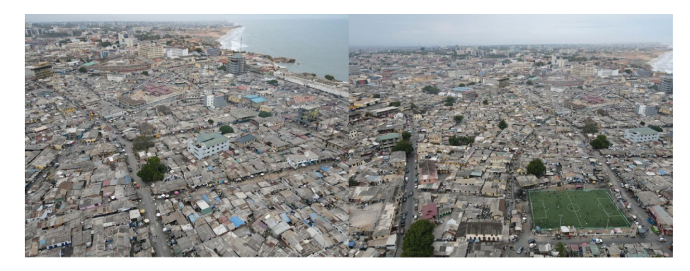
Figure 1. An aerial view of Ga Mashie.

Accra, and will use Global Positioning System (GPS) to map the commercial and built environment, including the locations of all food and drink outlets, health facilities and physical, religious, and social spaces.