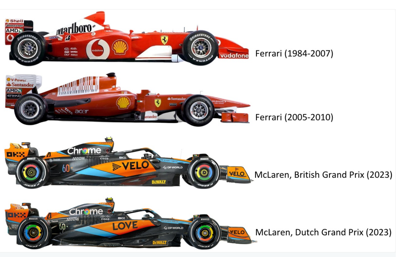
Figure 3. Comparative visuals of F1 cars showcasing the evolution of industry branding strategies. Featuring overt Marlboro trademark vs subliminal red and white barcode design, which would blur into a semblance of the Marlboro logo at high speeds, alongside trademark "VELO" branding vs reworded "LOVE" branding during the Dutch Grand Prix.

Beyond motorsports, professional e-sports and football players have been increasingly seen using these products, often citing leisure, relaxation and their perceived performance enhancing effects as reasons for their use<sup>[16][17]</sup>. In the U.S., similar patterns are observed with smokeless tobacco products having long been entrenched within baseball culture<sup>[18]</sup>.