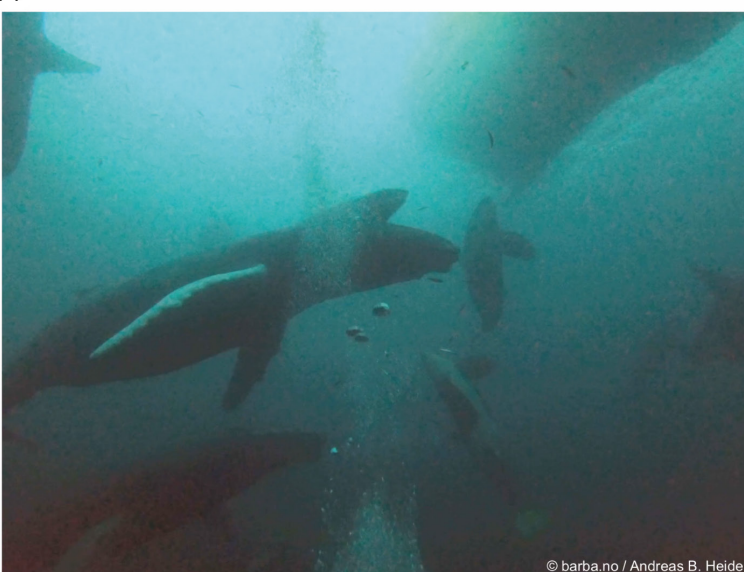
FIGURE 1 Underwater video footage from a whale mn17_026LLa. Images of (a), (b), (c), and (d) were recorded by animal-borne video camera and an image of (e) was taken by an underwater camera of documentary program industry staff. (a) killer whales and fishing ropes. (b) dead cod. (c) dead herring. (d) a tagged whale raised its upper jaw, presumably a motion associated with engulfing the fish. (e) a humpback whale and killer whales feed fish together around fishing boats.