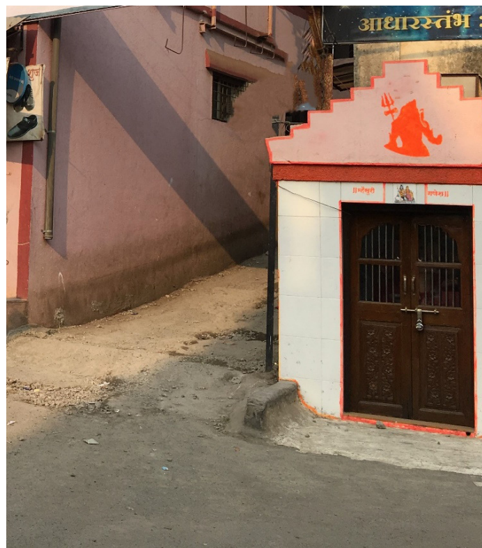
Figure 4. A mandal constructed at a crossroad.