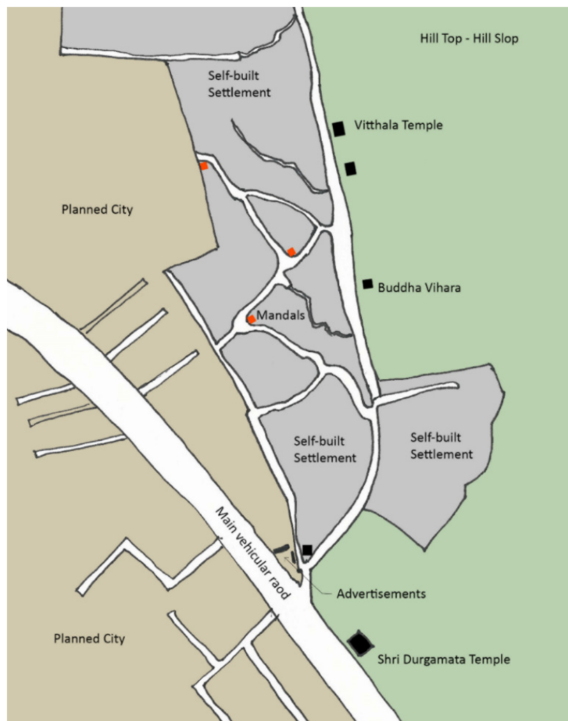
Figure 1. Plan of self-built settlement 1.

That is, both neighbourhoods have material assemblages at borderlands that are produced at the material and discursive boundaries between the formal/informal, private/public, vehicular/pedestrian, secular/religious, human/nonhuman, or new/old. To explore the subaltern agency and politics through material assemblages at the urban borderlands, I make use of ethnographic observations, policy documents, and in-depth interviews with 60 participants engaged in slum rehabilitation projects. The participants of this research included residents of the two settlements, real-estate developers, landowners, local politicians, and experts. Focusing particularly on what participants do with the borders being generated by colonial modernity helps uncover the agency they exercise in disobedience to the colonial modernist border-making practices. The following sections specifically explore four material assemblages at urban borderlands—namely walls, mandals , ecological boundaries, and alleyways. These borderlands were chosen due to their significance to the residents' struggle to face the impending slum rehabilitation projects. In other words, I used the references to material artefacts mentioned by the residents along with my own ethnographic observations to extrapolate the logic of disobedience from people's narratives. The rest of this article demonstrates how borderlands become a fertile ground for subaltern agencies and politics to come into being in disobedience to colonial modernity.