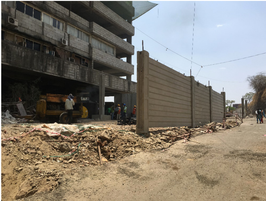
Figure 3. Wall separating free-sale apartment building (on the left) and access road to rehabilitation building (on the right).

Rambhau told me that “the builder is building the wall for his benefit; the wall is not for slum residents’ benefit.” Rambhau’s remark resonates precisely with Breitung’s (2011) observation that market logic produces territorial separation for profit-making purposes. A private developer corroborated the fact that separating slum-rehabilitation buildings from free-sale buildings helps in making the free-sale apartments financially comparable to other non-slum development schemes in Pune. Without the conspicuous separation between the slum site and the free-sale site, the prices of the free-sale apartments are much lower. Consequently, the developer was constructing a wall to separate the free-sale housing units from rehabilitation units to attract rich buyers. However, the wall was initially planned to be constructed very close to the hill (on the right-hand side in Figure 3) and the rehabilitation buildings would not have gotten a decent vehicular access road. In effect, the wall triggered and perpetuated the secondary citizenship treatment that the identity of “slum-dwellers” also produces, even after the settlement residents had moved into rehabilitation apartments. Vlassenroot and Büscher (2013) argue that urban development at the borderlands generates a socio-political struggle for identity. But Rambhau’s struggle to shift the compound wall a few meters sideways was not to maintain the identity of a slum-dweller but to undo it. Rambhau said to me: