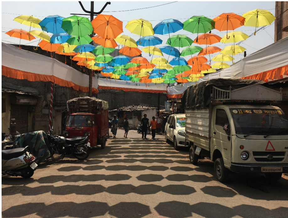
Figure 6. A vehicular/pedestrian road temporarily decorated for celebrations.

practice, residents of the rivulet bank neighbourhood had negotiated and secured one floor in the rehabilitation building for all the neighbours from one alley. Residents expected to celebrate birthdays and Ganapati festivals in the corridors of each floor, retaining the socio-spatial logics of the neighbourhood alleys, thereby transgressing the strict private/public and vehicular/pedestrian binary divisions.