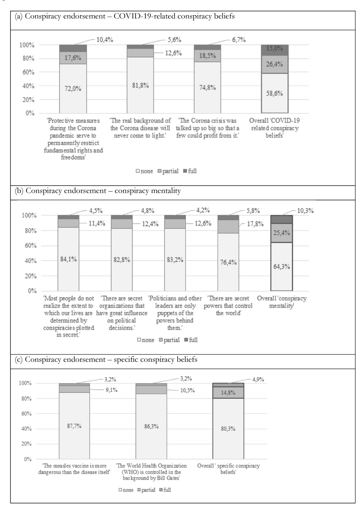
Fig. 2. Conspiracy endorsement: agreement with conspiracy items divided by COVID-19-related conspiracy beliefs, conspiracy mentality, and specific conspiracy beliefs.