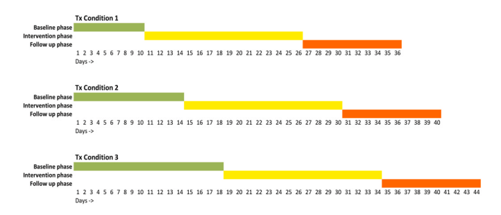
Fig. 1. Randomization of participants to treatment (Tx) conditions. Participants will be randomized to one of two samples of three participants. Within each sample participants will be randomly allocated to one of three baseline conditions: a 10-day, 14-day, or 18-day baseline.

A single case experimental design (SCED) involves the repeated measurement of an individual's behaviour in the presence and absence of the intervention, thereby enabling the individual to serve as their own control [27]. A concurrent multiple baseline SCED will be used to investigate the effects of LSVT LOUD® on the primary outcome of drooling, and the secondary outcomes of swallowing and speech. The application of randomization will be made to phase onset with the starting point of intervention differing for each participant (see Fig. 1 below). The baseline phase will be followed immediately by a 16-session treatment period over four weeks. The follow up period will take place 12-weeks after the last treatment session has taken place. Concealed randomisation will be used to allocate each participant to one of three treatment baseline conditions: a baseline length of 10 days, 14 days or 18 days, which means the starting point of intervention will be staggered, and different for each participant in each set of three. All participants will begin the baseline phase on the same day. A concurrent design enhances internal validity by controlling for maturation effects and minimizing environmental influences [1,28].