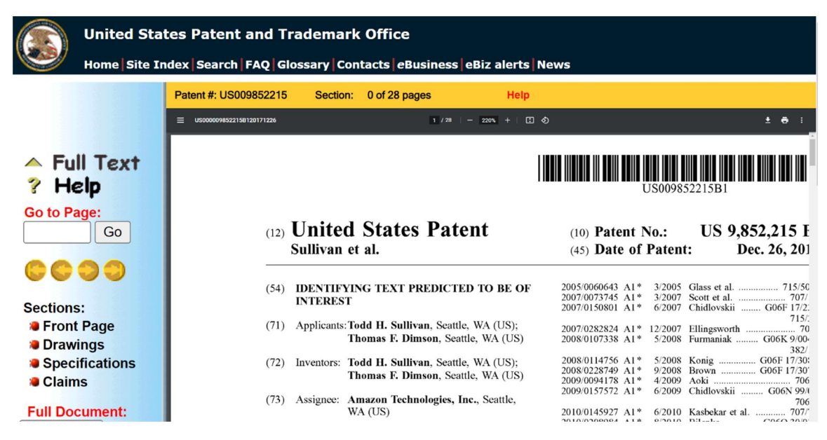
Figure 4. The PDF version of the same patent.

document layers of the digitization stack. Consequently, the USPTO has prioritized a sense of print-based 'documentness' over the potential for data to be rendered in different, more accessible, formats such as reflowable HTML with all media and data included.