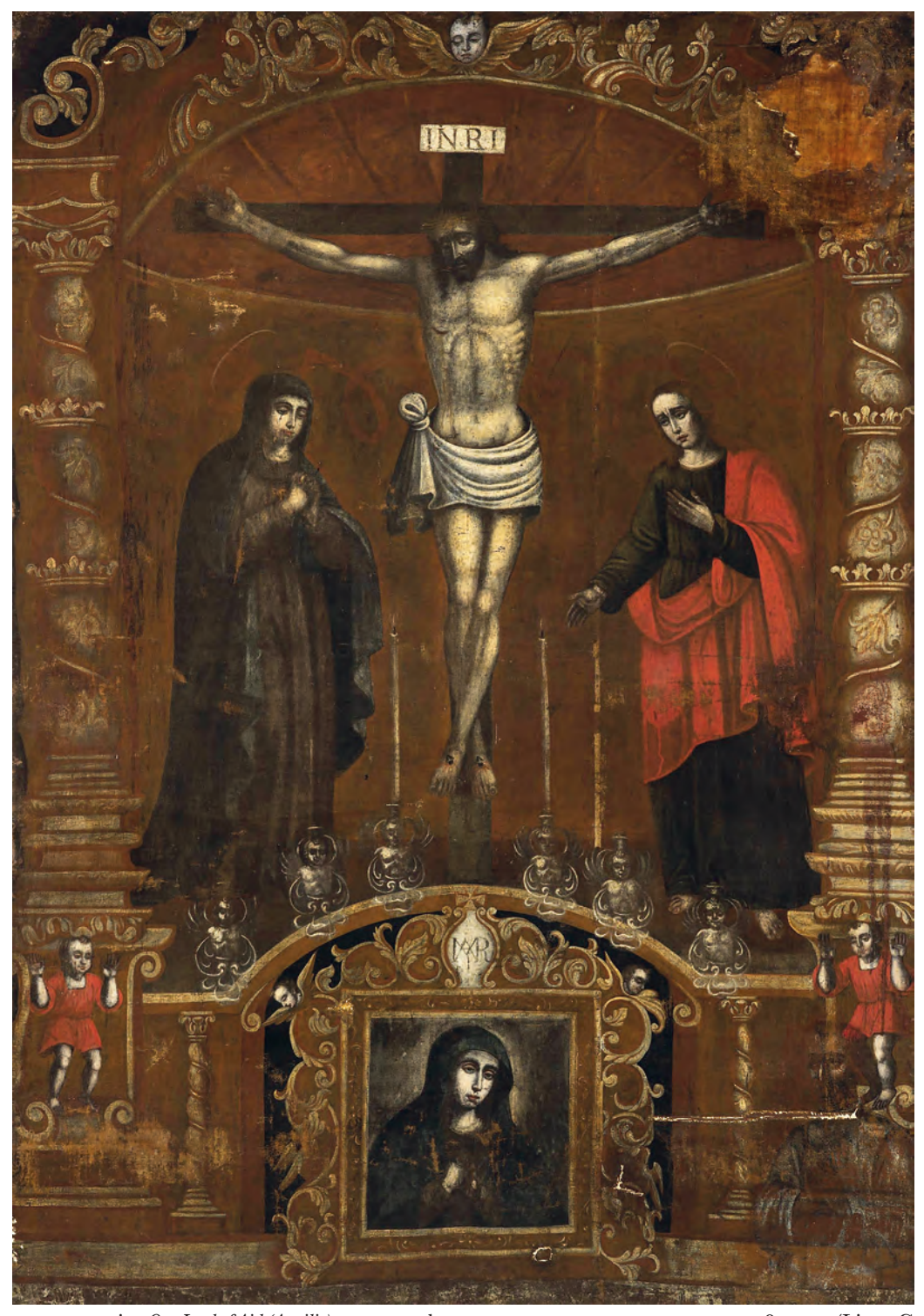
30. Anonymous artist, Our Lord of Aid (Auxilio), seventeenth century, tempera on canvas, 1,250 x 1,870 mm (Lima, Convento de la Merced. Image Daniel Giannoni).