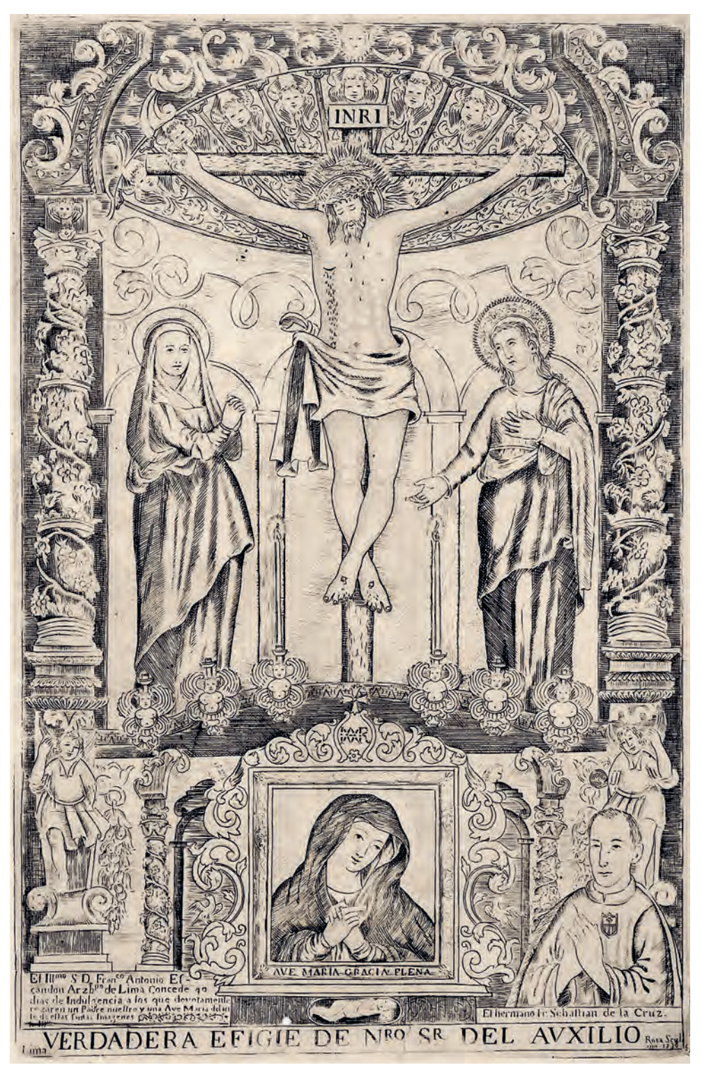
29. Juan Francisco Rosa, Our Lord of Aid (Auxilio), 1739, engraving, 265 x 171 mm (Lima, Biblioteca Nacional del Perú).