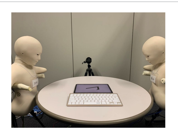
FIGURE 2 An experiment demonstration from the participant's viewpoint. While the participant was completing the number-verification task, the two Telenoid robots only exhibited slight movements such as 'breathing'.

The two robots were placed on the left and right side of a round table at a distance of about 10 cm to the table. To make sure participants can distinguish between them, both of the robots wore a name tag during the task. The name tags and sitting positions of the interactive/ noninteractive robots were counterbalanced across all participants. In our current task, we used a 'Wizard of Oz' approach. During the experiment, one of the experimenters controlled the robots from a separate room, with the control room separated from the laboratory by an opaque partition wall. The experimenter observed participants through a webcam, keeping them unaware that a human operator was controlling the robot's actions. When the participant was guided to sit on the chair, the interactive robot would look towards the participant and then wave its hands, while the noninteractive robot looked down at the table. Then the interactive robot turned its head and looks straight