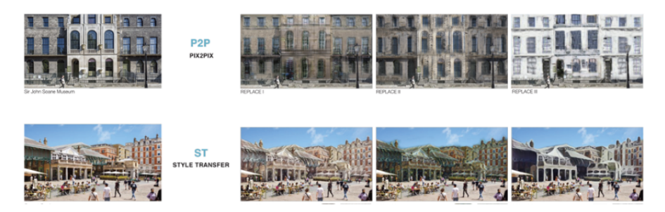
Figure 4. Pix2Pix VS Style Transfer

For the Replace action, several algorithms from Pix2Pix (Isola et al. 2016) or Style Transfer (Gatys et al. 2016), were tested to give the user a wide catalogue of options to choose from. The option chosen for the prototype app was the Style Transfer. The model was trained with a collection of architectural images to create different styles, pre-classified per architectural style. As a result, the user could choose between several Machine Learning generated skins to replace the existing architecture in the environment.