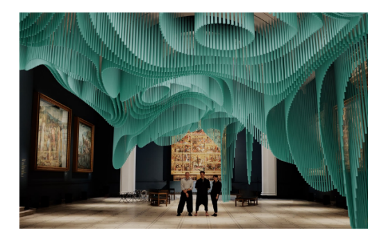
Figure 2. Medusa Project, V&A Museum. 2021.