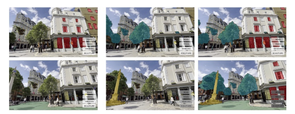
Figure 3. Image Segmentation training.

For the Replace action, several algorithms from Pix2Pix (Isola et al. 2016) or Style Transfer (Gatys et al. 2016), were tested to give the user a wide catalogue of options to choose from. The option chosen for the prototype app was the Style Transfer. The model was trained with a collection of architectural images to create different styles, pre-classified per architectural style. As a result, the user could choose between several Machine Learning generated skins to replace the existing architecture in the environment.