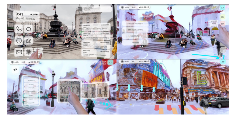
Figure 5. App Visualization for smartphones.

The augmented environment proposal of the project positions itself into a hybrid level of augmentation (Cetralized/Corporativist). The app allows us to visualize practical information like events or communications with friends and modifies and changes the reality we perceive. The result is that Level Two and Three augmentations being the third most prevalent. Due to this fact, there was an interesting discussion within the project on how the app could be managed. The project then proposed that the app could look at three scenarios, Utopian, Neutral and Dystopian. In all three scenarios, the augmentation would be managed by a third party and for commercial use of the app. The Utopian scenario proposes a use with positive social impact, so styles and augmentation will be not only for improving the user's perception of the city but to promote integrative values events. The Neutral scenario establishes that the central authority would manage the augmentation and would be only based on the user's taste and basic practical, unbiased information with it. The Dystopian will be a scenario where the central entity/corporation would allow the user a certain configuration but full of third-party content for commercial or political uses(figure 5).