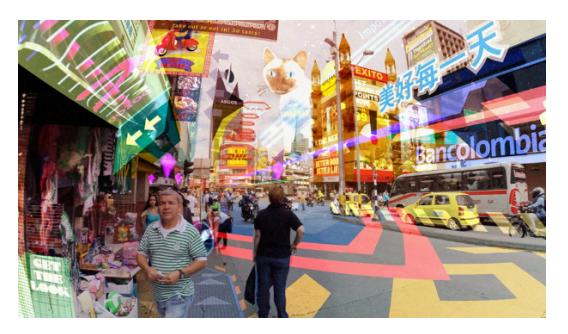
Figure 1. Hyperreality by Keiichi Matsuda. 2016.

In fact, a major issue we are facing is not that what we see is altered or edited to look different or more attractive; the real risk is who or what is driving the simulation. In its origins, the internet was born for freedom and communication (Outside the military origins). The original Hackers, which was an early self-named group of programmers, envisioned the internet as a place outside the system that was not controlled by big corporations like IBM (Levy 1984). This scenario of freedom now seems all but a long-lost dream. The reality is that the newer internet platforms have conquered the Internet, and in fact, they have doubled their influence and size if we compare them with the previous generation. They are far more influential in our lives and poised to control the future of communications (Lainer 2013).