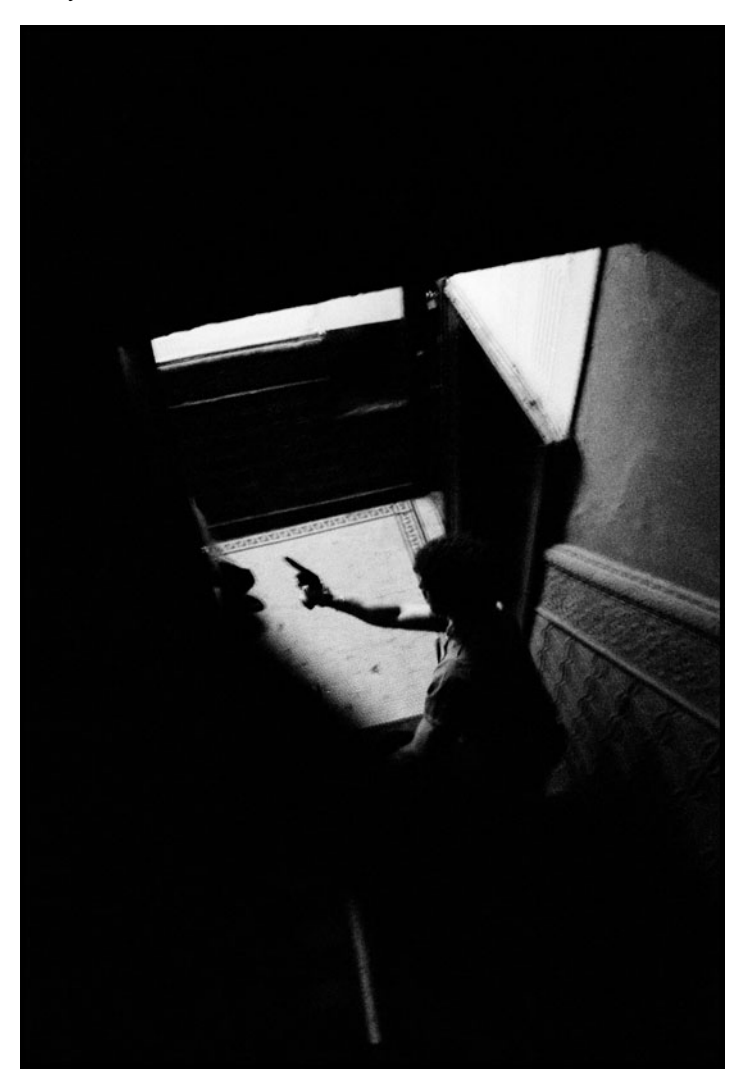
Figure 4. "An officer once said to me that he always worried about his family at home. Who, he wondered, protected them when he worked nights? It made him diligent."

the ways in which they collaborate in veiling the police as necessary agents of urban social order. And yet, occasionally, the entanglements between the carceral and the domestic are made explicit: what is often quietly mobilized throughout the photobook as a mechanism through which to mask police brutality as police care is overtly expressed. One particular photograph, for instance, offers the reader a bird's-eye view of the entryway to a tenement building (Figure 4). At the bottom of the stairwell, a police officer