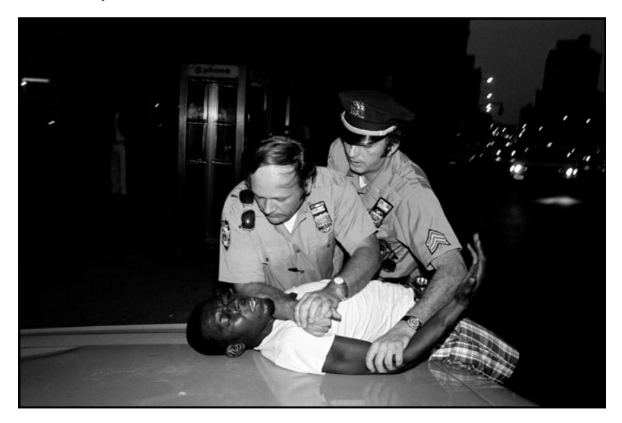
Figure 3. "A family argument. When the man went for the woman, the police jumped him."

Rather than produce a new repertoire of police photography, the image strongly evokes mainstream photographs from the civil rights movement. It rhymes with the widely reproduced images from Birmingham, Selma, and Freed's own Black in White America , that had, less than a decade earlier, given police brutality a legible visual form. These now iconic photographs distilled the racial tensions of the civil rights movement into violent clashes between white officers and black protestors, undermining the legitimacy of the police in the collective American imaginary. However, despite the intelligibility that Freed's photograph's caption, affixed to the left-hand side of the page spread, alters its meaning: "A family argument. When the man went for the woman, the police jumped him."<sup>23</sup> This, too, Freed suggests, is a family photograph.