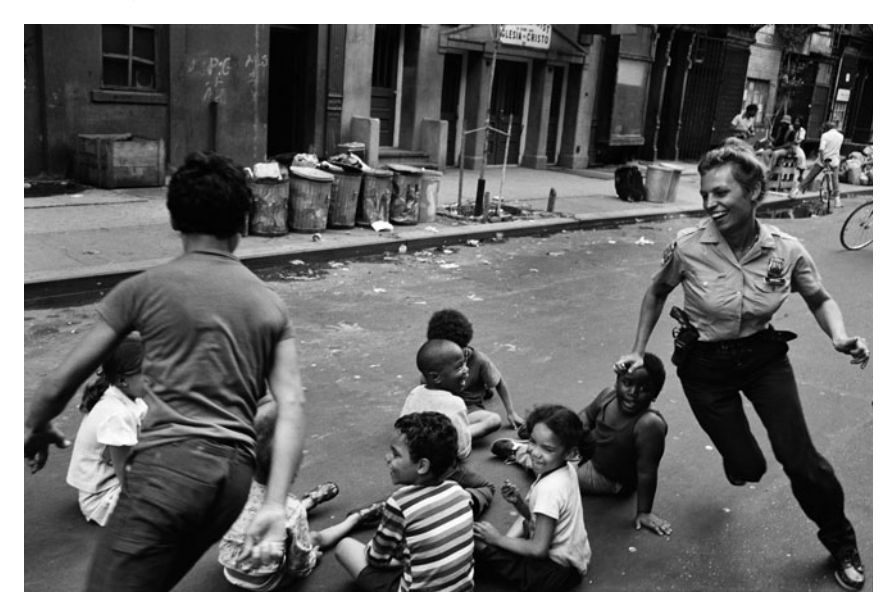
Figure 1. "A policewoman plays games with community children. Shortly afterward, the officer became pregnant and was assigned a desk job for the period of her pregnancy."

camera's lens and, through it, the reader. The photograph seamlessly weaves the police into a horizontal tableau of urban street life, framing the police not as a regulatory force of social control, but as a harmless, even positive, intervention into everyday life. By capitalizing on the perceived harmlessness of white femininity, the photograph constructs a sentimental view of the institution as protective and maternal, suggesting that the role of the police is to protect a neighbourhood's most vulnerable residents and to ensure their vitality into an unknown future. The police officer stands in for the parents who are absent from the photographic frame: she momentarily completes the image of the nuclear family, belying the ways in which the police make absent the actual and varied kinship structure of urban communities.