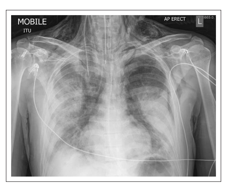
Figure 3. Chest radiograph from patient 3 demonstrating left-sided pneumothorax, subcutaneous emphysema, and bilateral consolidation. AP = anteroposterior, ITU = intensive treatment unit, L = left.

Regardless of mode of respiratory support, all patients maintained median peripheral oxygen saturation greater than or equal to 90% and median Pao<sub>2</sub> greater than or equal to 8 KPa for the duration of the period studied. It was not possible to retrospectively establish whether patients received recruitment maneuvers, but these were not routinely performed in stable patients established on IMV. In four cases, there were temporally and anatomically relevant procedures for which subcutaneous emphysema, pneumomediastinum, or pneumothorax are recognized