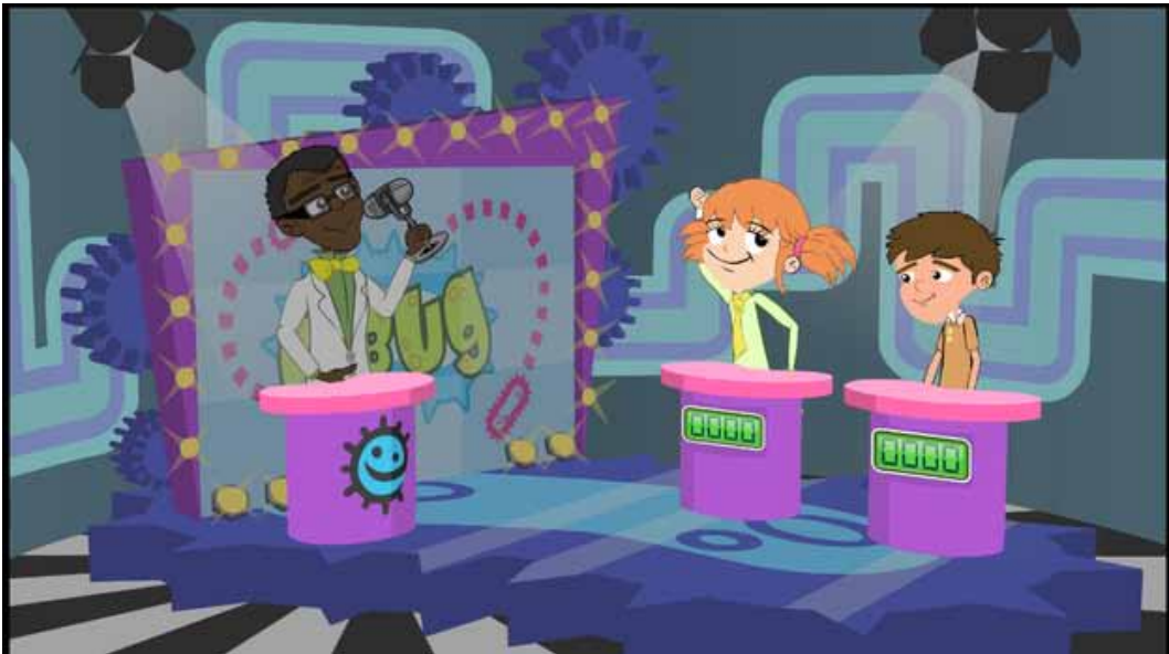
Figure 4. In-game assessment

For evaluation purposes only we learned through the actual game and not through the evaluation game, no feedback is provided in the first round, called “Blind Question Round”, because this round is provided before the actual game play took place. However, feedback in the form of whether the questions are right or wrong is provided during the second round, which is performed at the end of the game level.