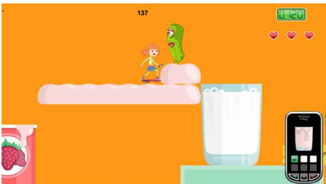
Figure 1. Player encountering a lactobacillus bacteria

Although both the evaluation performed before and after the playing a level can provide the player for feedback, to not affect the learning outcome, the quiz provided before the game level does not