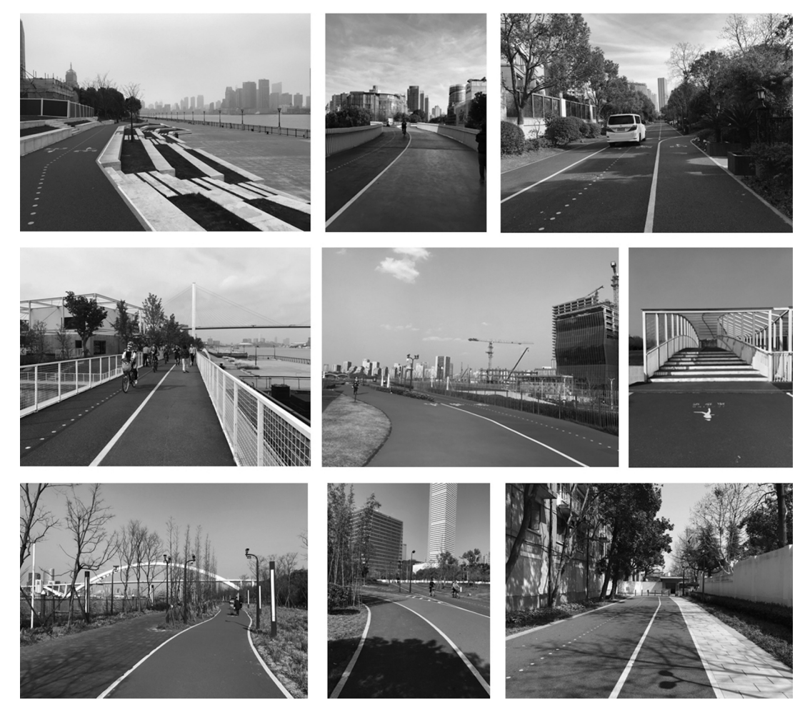
Figure 2. Examples of the waterfront "three paths."