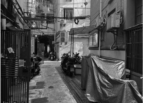
Figure 7. Public space created in micro-regeneration once again becomes encroached on.