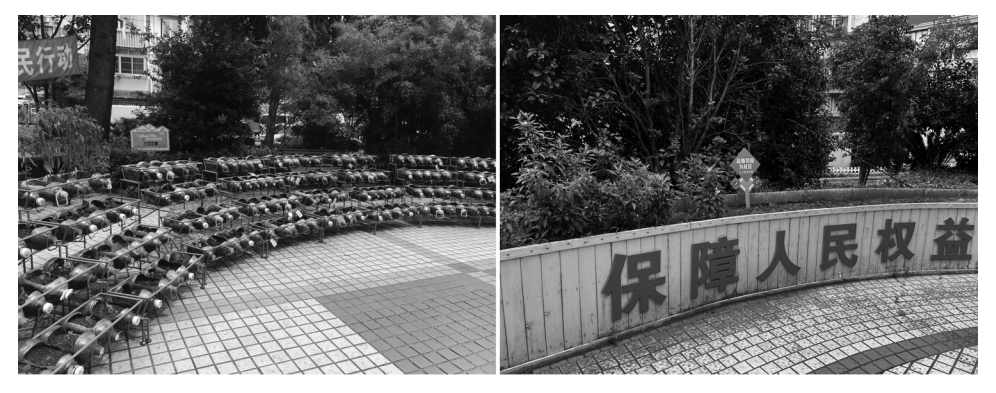
Figure 8. The upgrade of the bottle garden.

policy requirement by upgrading the bin storage rooms and urging residents to abide by the recycling rules, in the community where the "good neighbor pergola" was located, the residents' committee set up a bottle garden on the pergola square. As an incentive to actively follow waste sorting rules, residents could adopt a flowerpot made of waste plastic bottle in the bottle garden to grow flowers. The bottle garden has since been upgraded into a small vegetable garden with proper planters and more durable structural materials (Figure 8). The residents' committee works with volunteers to grow vegetables to distribute to elderly members within the community. This case shows that while microregeneration could transform the appearance of community public spaces, what is more important is a long-term management mechanism that not only keeps the freshness of the physical space but also invigorates it with active uses, thus turning passive spaces into active ones.