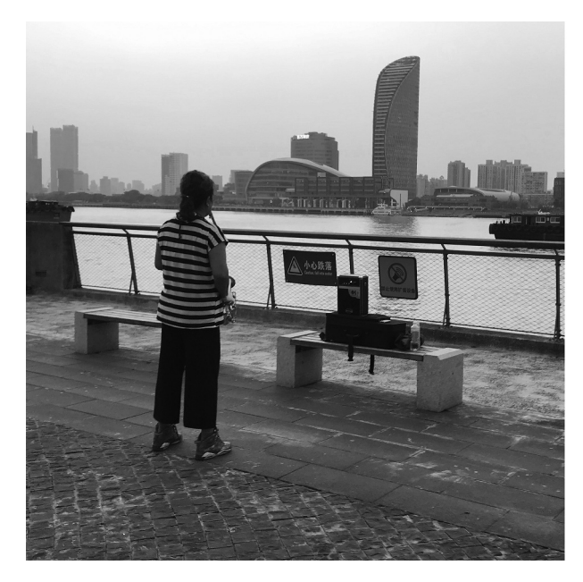
Figure 4. Practicing musical instrument right in front of the warning sign.