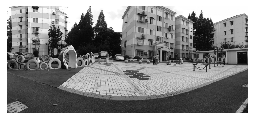
Figure 6. An example of micro-regeneration intervention: play area and exercise equipment.

As a supposedly more participatory process, micro-regeneration looks to involve residents in consultation and design but residents as nonprofessionals often lack a clear understanding of what micro-regeneration entails. Presenting them with a blueprint in formal consultation meetings or surveys might not be enough to convey the clear message, and residents sometimes only understand the projects more intuitively when they see them materialized into construction sites. This is why the construction phase of micro-regeneration tended to be more contested than the initial design and formal consultation stages. Since space in old neighborhoods is often limited, the construction sites of micro-regeneration projects usually couldn't be completely fenced off or shielded away from residents. While residents might not always grasp all the details of the design interventions on paper, the process of physically building these spaces concretized what the changes would be to their neighborhoods and their personal lives. As a result, residents were more likely to voice their opinions and challenge the design during construction than in the initial consultation when they thought the project damaged their interests.