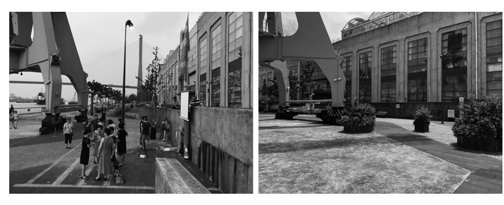
Figure 5. Planters are now placed (right) where people used to gather to sing "red songs" back in 2019 (left).

As its name suggests, micro-regeneration is "small and micro" design interventions on leftover or under-utilized spaces in and around deteriorating old neighborhoods. Such small-scale upgrade supposedly incurs minimal disruptions to residents' daily lives and the existing urban built fabrics. It also requires comparably smaller financial inputs and a shorter time to implement, since these neighborhood projects would not require lengthy formal planning and administrative procedures. This was especially important for the municipal planning authority who wanted to use the micro-regeneration experiment to quickly test the water and produce exemplary projects to be promoted more widely. Apart from such practical rationale, choosing neighborhood public spaces to start new urban regeneration experiments was symbolically significant because they were where residents' daily lives unfold, and the improvement thereof meant "addressing the detailed and intimate concerns of urban residents."