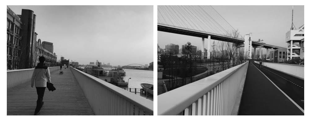
Figure 3. A segment of the "three paths" needed to be elevated to bypass the unmovable buildings.