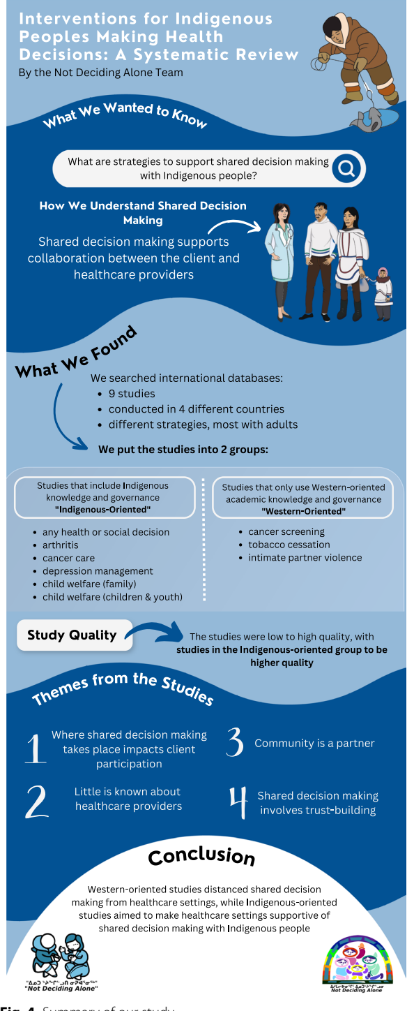
Fig. 4 Summary of our study

We used a conceptual framework to extend consideration of the relational features of shared decision making processes to identify: impacts of place (where shared decision making happens) on opportunities for participation in health decision making; a gap in the reporting about characteristics of health care providers in relation to shared decision making processes; the inclusion of community as a source of knowledge and support and a partner in shared decision making;