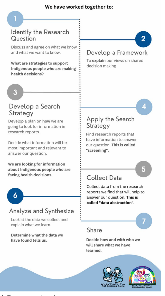
Fig. 1 The systematic review process

We want to learn how to develop and test strategies to support Indigenous people making health decisions, and what factors impact the use of shared decision making interventions with Indigenous people.