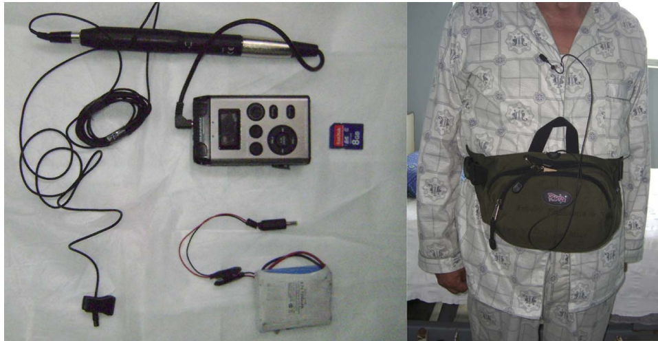
Figure 2 Picture of the Cayetano Cough Monitor (CayeCoM).

algorithm. On the basis of classifier outputs, each acoustic event will be marked as ‘cough’ or ‘not-cough’.