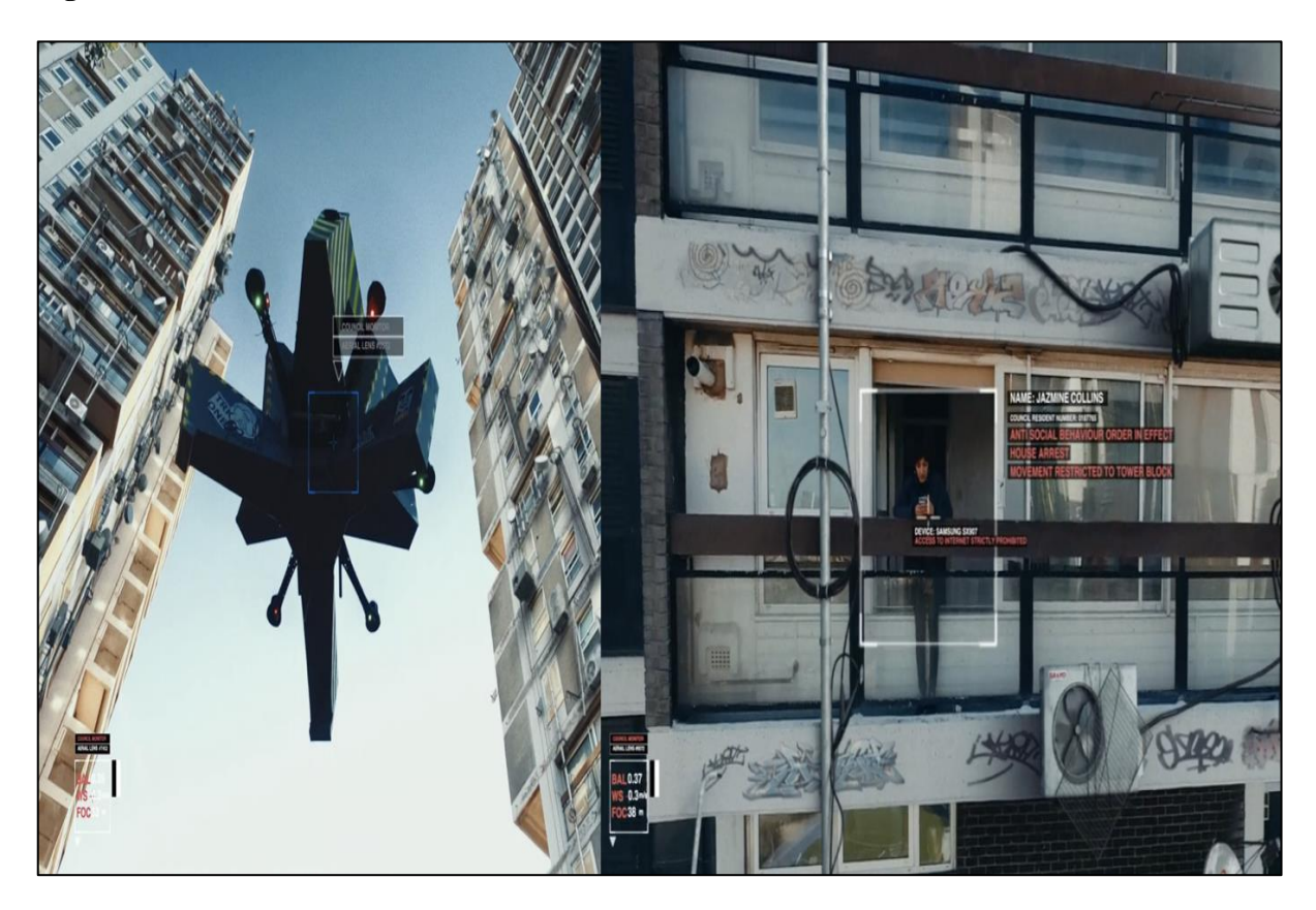
Figure 1. Drones and state surveillance

The two teenagers portrayed in the film are positioned both as prisoners, objects of state surveillance who are held in home custody, and as lovers who exchange notes through drones which they have hacked and appropriated for their own socio-emotional purposes. In the former case, the writing practices appear as authored by the drones, thus placing the film spectator in the capacity of a ratified addressee who is engaged in surveillance and monitoring of the individual teenager subjects through side-played communication with the drones (see Figure 1).