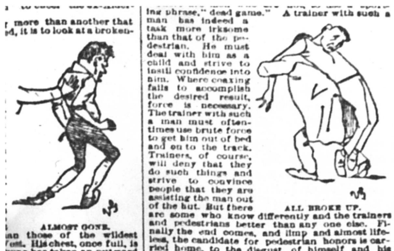
Figure 3. Illustrations of worn out contestants "Almost Gone" and "All Broke Up," by Valerian Gribayedoff in "Far Beyond the Record," The World , 2 May 1884:1. (Newspaper and Current Periodical, Library of Congress, LCCN-sn-86071683)

Granted there was money involved, but the hope or promise of economic reward did not justify the degree of suffering many endured. The World journalist wrote that immediately after having stopped, the pedestrians "seemed to have forgotten all their pains and aches, or was it as many supposed—that they had suffered so much that they could feel no longer and if they fell now on this last lap it would not be to faint, but to die?" (TW 4/5/1984). The reporter seemed unable to decide whether the event was glorious or shameful.