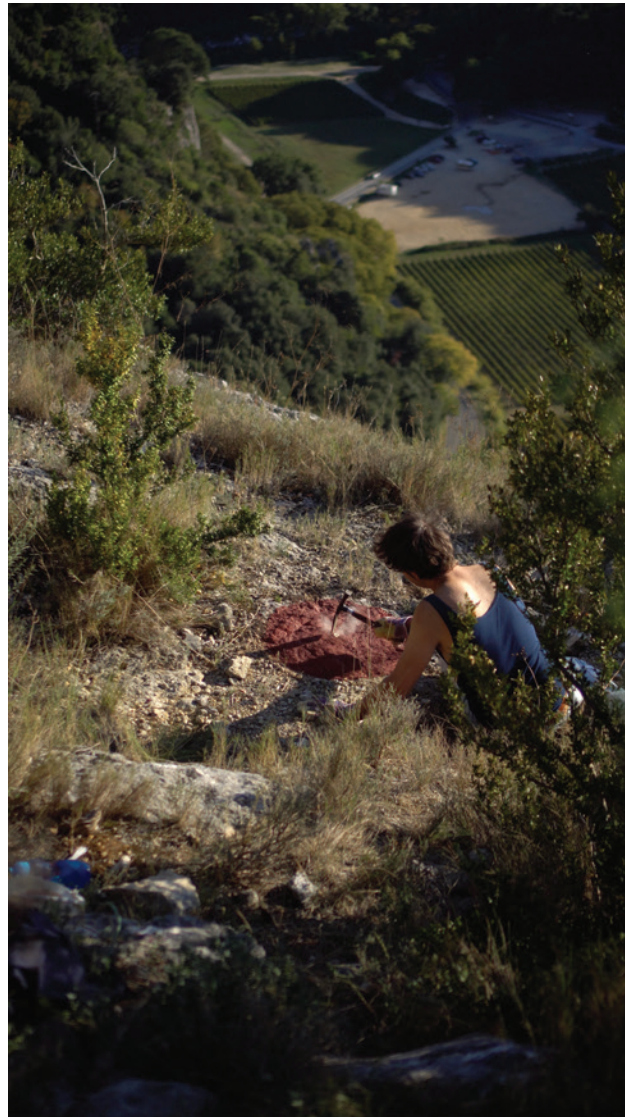
Figure 3. Hardliz, R. (2016) Chauvet III (or Cave of Forgotten Dreams) . Still from video. Pont d'Arc

The camera creates a coalition between me, as the film-maker, and Tobasi, as the protagonist of the film. We attempted to rewrite, or rather recompose, the play so that it would fit the circular movement of the rotating camera. The fact that at times the actor follows the movement of the camera generates a strange feeling of nausea in the spectator, a feeling that is related to both the play and the political state to which it refers. At the nodal point of the camera in the centre of the theatre, the affects that are generated by the rules that the occupation puts on the ground in Palestine may become sensible to the viewers.