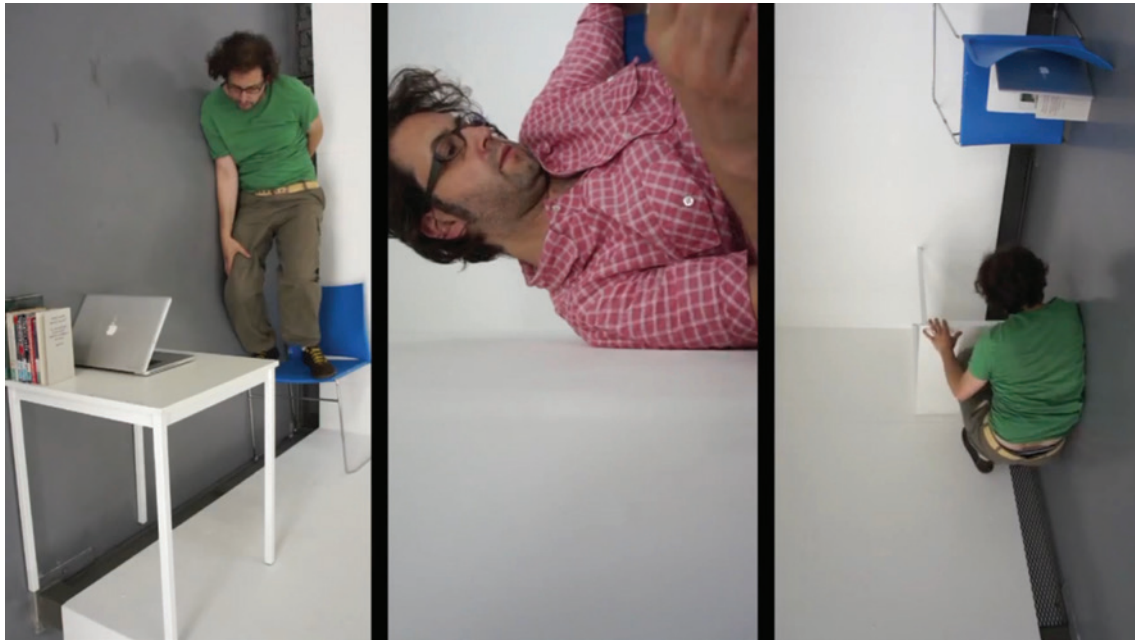
Figure 2. Hardliz, R. (2014) Ornament as the Science of Passionate Disinterests . Still from video. London

theatre so it could get used to it. However, when I wanted to direct the donkey to the correct position in the shot, it bucked and resisted. I had to shoot the scene with the donkey standing in the position chosen by the donkey, hoping that the footage could be used for the film in some way. Unfortunately, I was unable to integrate the material in a way that would make sense. Ultimately, the stubbornness of the donkey may have saved me from overdoing the visual complexity of the film by generating too much distraction. As it is now, without the donkey, viewers focus on the actor and his acting, on the moves of the camera and on the sound – the three constituent elements of the film (Figure 5).