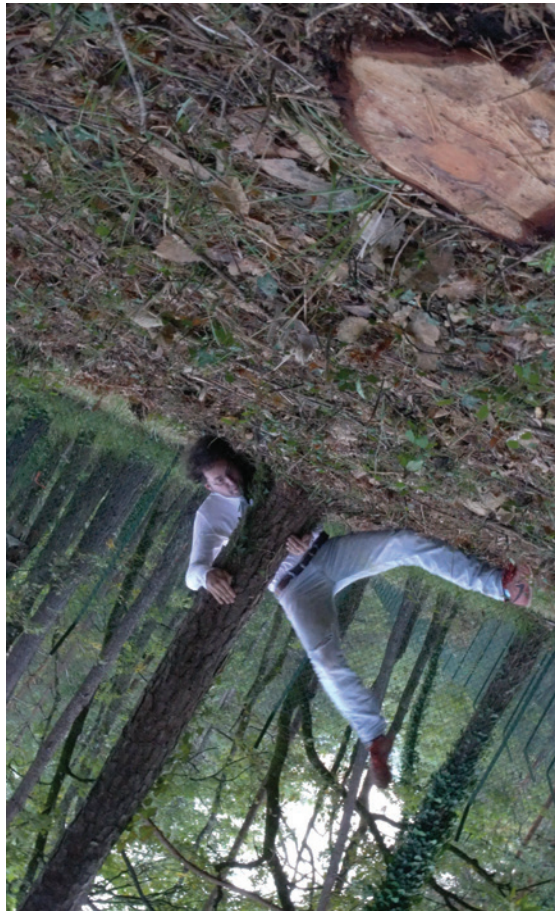
Figure 4. Hardliz, R. (2016) Lascaux V (or The Birth of Art) . Still from video. Lascaux

forms an essential component of Palaeolithic art. According to Azéma (2010: 453, my translation) , these animated animal drawings, by interacting, define 'the terms of a stammering visual grammar'. From the first image on the walls of the Stone Age, 'graphic narration' or 'narrative figuration' is born, which marks the beginning of 'writing and of all the current visual media', Azéma (2010: 453, my translation) writes.