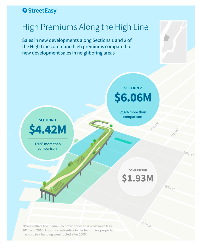
Figure 1. Eco-gentrification: high premiums along the High Line

Two of these approaches are the 'Ladder of Citizen Participation'<sup>30</sup> and community listening sessions. The former focuses on the concept of power diffusion between the public sector and residents.<sup>31</sup> This ladder consists of eight rungs within three distinct levels of citizen participation: (a) the bottom two rungs (manipulation and therapy) represent non-participation or no power; (b) the middle three rungs (informing, consultation and placation) represent tokenism; and (c) the top three rungs (partnership, delegated power and citizen control) represent power.