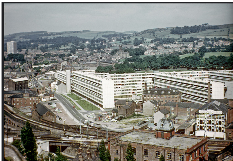
Image 1 - Macclesfield and Victoria Park flats prior to the building of Silk Road 3

The road itself is not the boundary between the town and country, but the proximity of the countryside is important to many residents, and the hills and woods are visible to travellers from various points along the Silk Road. These are among the attractions of Macclesfield to many of its more recently arrived, and generally more affluent, residents; and many have explained to us that the ability to drive, walk or cycle 'out' is part of what brought them to settle here. As one woman, who moved to Macclesfield a year ago, put it: 'I think it's very varied and there's lots of countryside around, which is brilliant. So, it's a safe kind of haven. And the town's quite compact, but there's lots of different variations, villages around, which are all quite distinct'.