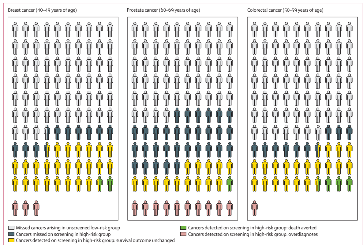
Figure 2: Modelled outcomes for new screening for 100 individuals who would currently present with incident symptomatic cancers Presented are outcomes if a new screening programme were offered to the PRS-defined high-risk quintile (20%) of the population for breast cancer aged 40–49 years (screened using digital mammography), prostate cancer aged 60–69 years (screened using prostate-specific antigen [3 ng/mL]), and colorectal cancer aged 50–59 years (screened using faecal immunochemical test [20–50 µg/g threshold]). Assumptions include full uptake for PRS profiling and screening and that all cancers in the screened population are present at the time of screening (rather than arising as interval cancers). Cancer survival is based on UK diagnoses for 2008–17.

high-risk quintile would avert up to 158 (13%) of 1262 deaths, compared with 95 (8%) from screening the oldest quintile (20%; table 4). Multi-parametric MRI offers a sensitivity of 89% for a specificity of 73%, meaning that screening of the PRS-defined high-risk quintile would be predicted to increase detected cancers to 6878 (41%) of 16 853 and deaths averted annually to 438 (35%) of 1262 (appendix p 28). For prostate cancer, if screening were offered once a year (or once every 2 years) to men aged 60–69 years, 692 364 (or 346 182) screening tests would be required annually (table 4). Given that about 3·6 million MRIs are performed every year in England across all indications, first-line multi-parametric MRI screening for just the PRS-defined high-risk quintile of men aged 60–69 years would require an immediate 19·2% (or 9·6% for screening once every 2 years) national increase in MRI capacity. This extra capacity is predicted to cost approximately £208 (or £104) million per year (estimated from a cost of £301 per multi-parametric MRI). 19,20 Due to the 73% specificity of multi-parametric MRI, an additional 191 730 (or 95 865) follow-up or confirmatory tests (typically biopsies) would be required annually compared with 105 168 (or 52 584) follow-up or confirmatory tests for PSA-based screening.