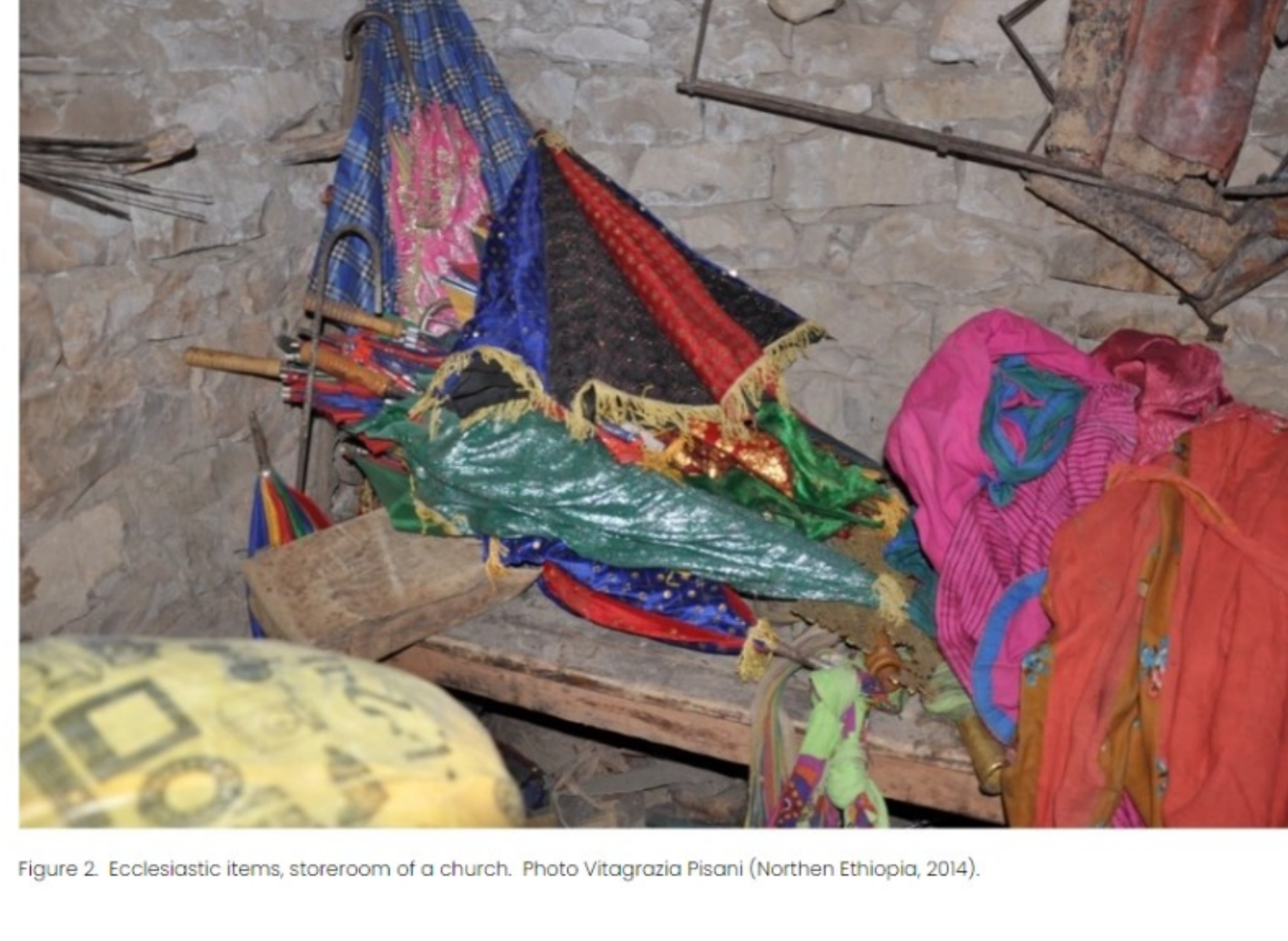
Within the 'eqā bet are housed a number of objects that are necessary for the spiritual and material needs of the priests or monks who perform religious services within or near the

the side rooms may also serve as a facility for storing materials (cf. Bausi 2014, 51; cf. also Pankhurst 2014, 252a). When detached from the church, the 'əqā bet may consist of a solid round or rectangular stone tower, or it may be a simple round or rectangular hut, which, being built with more perishable materials than those used for the church, requires frequent maintenance. Some churches, especially the largest ones, may have more than one storeroom (cf. Chernetsov 2005, 345a).