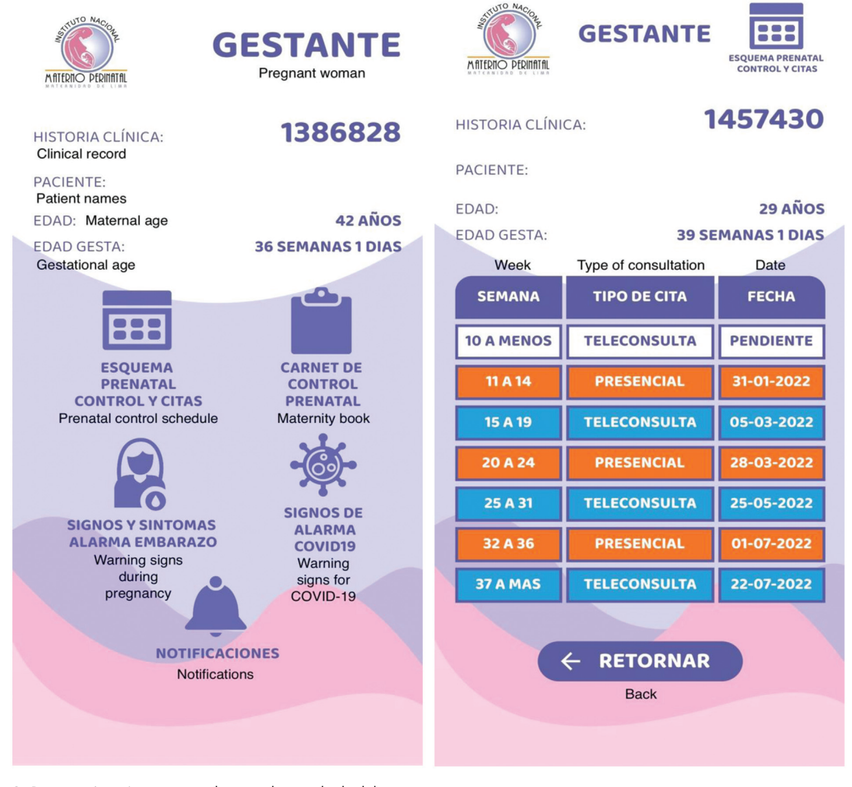
Fig. 1 Prototype's main screens and prenatal control schedule

By clicking on each appointment, a screen is displayed with all the scheduled tasks for the corresponding gestational age (Figure 2), such as clinical evaluation, obstetric ultrasound scan, lab tests, provision of medications, Pap smear test, vaccination, family planning counseling, and psychoprophylaxis. Tasks not carried out will be marked in red. The option of the maternity book enables the user to download a printable version of the updated information about clinical history and lab test results. Additionally, patients have access to information about the alarm signs of pregnancy, COVID-19 disease (>Supplemental Figures), and notifications about omitted activities and scheduled appointments (>Figure 2). We built several previous versions, which were modified according to patient feedback. A final version was tested for connectivity with the clinical computer-based record.