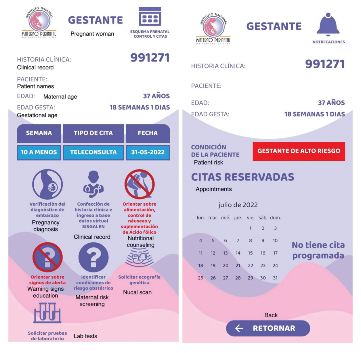
Fig. 2 Scheduled tasks for the corresponding gestational age and notifications screen