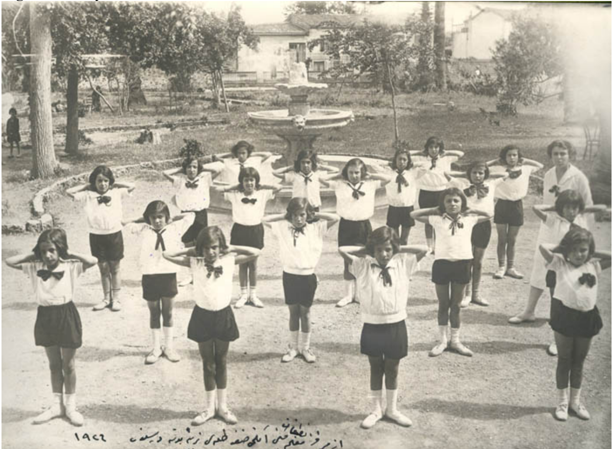
Figure 2a: Physical Education Classes

2a–c). A major resource on Turkish women's involvement in the Olympic Games makes the following point, which has been cited by several researchers: "The Turkish Republic, which proceeded on the pathway of modernization with giant steps, had to show the world that the Turkish woman now was no longer under the çarşaf (black veil) or behind the kafes (wooden curtain)" (Arıpınar, Atabeyoğlu, and Cebecioğlu 2000, 7). Thus women's participation in sports was perceived as a way to represent and demonstrate to the global (especially Western) gaze that the Turkish nation was succeeding in modernizing itself (Yarar 2005, Talimciler 2006, Atalay 2007).