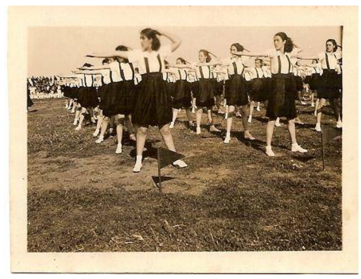
The first celebration of Gymnastics Fest, name of which is now "Atatürk's Day" after the date was pushed to 19<sup>th</sup> of May, 1938.

In 1938, Atatürk decided that the Fest should be celebrated on 19 May, which marks the beginning of the Turkish War of Independence. Therefore, the Fest transformed from a celebration of the coming of spring into a remembrance of the War of Independence. As it turned out, 19 May 1938 marked Atatürk's last public appearance. The celebrations continued throughout the next decades of the Republic. After the third military coup in 1980, the name of the Fest was switched to "Remembrance of Atatürk, Youth and Sports Fest." Once again, the event and its name were convenient tools to create and manage a collective memory (Figure 4).