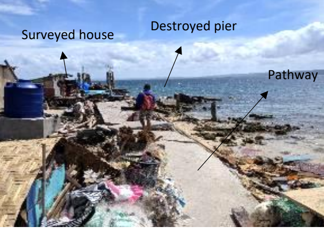
Figure 11. Left. A resident indicates the level of the water in front of the barangay hall. Right. At the right side of the photo is one of the houses surveyed in front of what is left of the pier (structure on the right side)