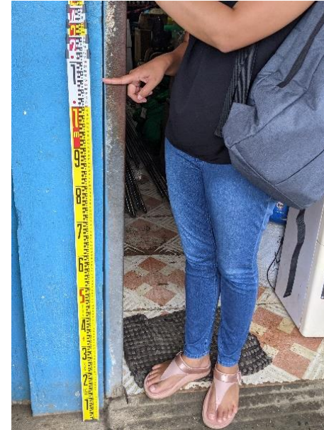
Figure 10. Left. Barge slammed into houses close to Tubigon port. Right. Inundation level in the shop seen on the left side of the figure.