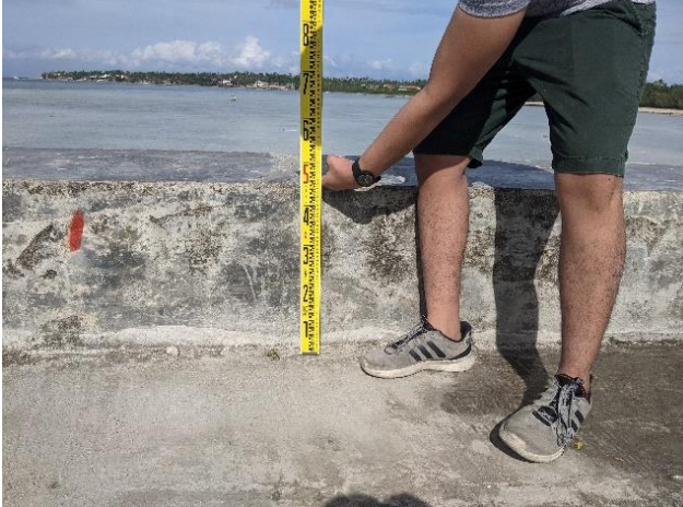
Figure 8. Left. Damage to port pier at Moalboal. Right. The storm surge level reached the top parapet on the side of the port pier.