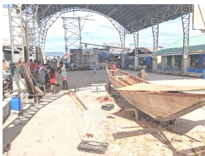
Figure 12. Left. Mudline in the barangay hall. Right. Basketball court adjacent to the barangay hall (building on the left side) and the remaining rainwater collection systems (blue cylinders on the right side).