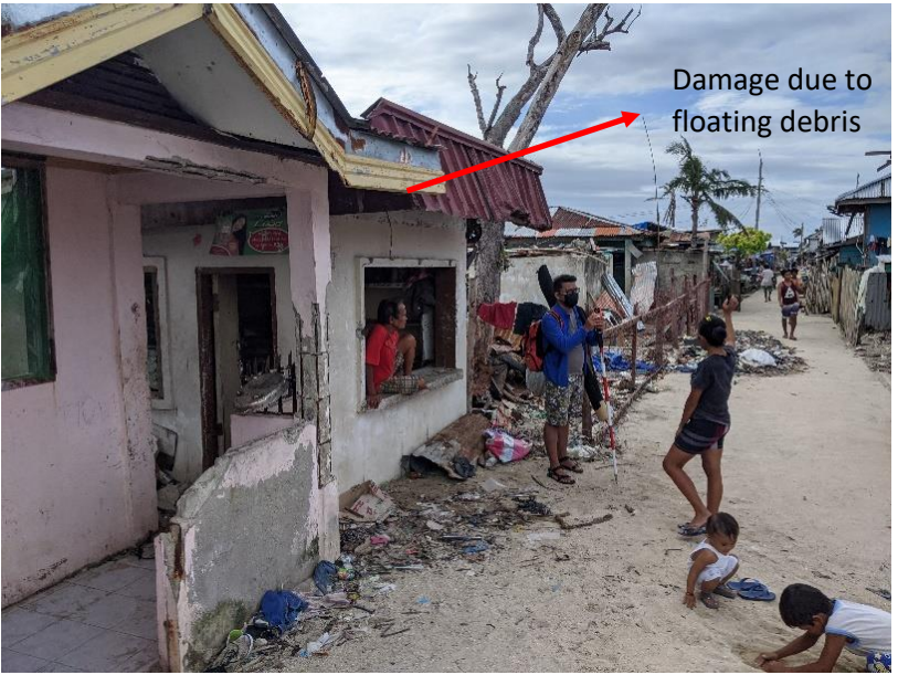
Figure 13. Left. Flooding level in front of the church of Isla Batasan. Right. Damage on edge of a roof due to floating debris.