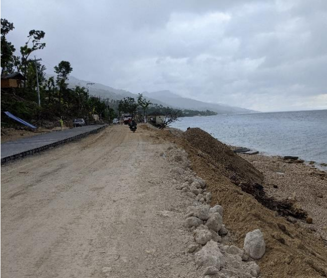
Figure 6. Left. In Malabuyoc houses were built on top of the beach, in many cases by reclaiming land. Right. The road between Malabuyoc and Alegria suffered severe scour damage and in some places was completely removed, with recovery activities underway at the time of the survey.