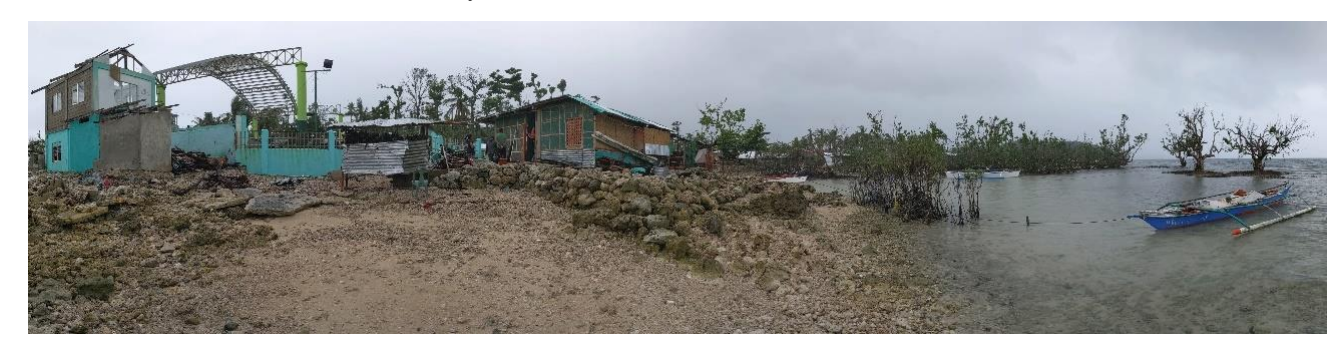
Figure 14. Rebuilt coastal house (at centre of the picture), adjacent to the basketball court.

This barangay faces the open ocean, and would have been subjected to the full force of the typhoon. In the area surveyed there was a basketball court, with residents of a house adjacent to it having been interviewed by the authors. The house was completely destroyed by the typhoon, leaving a thick pile of coral stones and gravel on top of it (the thickness of this layer was estimated at ~0.5 m, based on the interviews and the level of the rebuilt frame of the door, see Figure 14). Residents left this layer of rubble and, by the time of the surveys, they had rebuilt their house on top of it (the house also doubled as a small shop). While they had evacuated at 18:00 before the storm surge manifested itself, they indicated that they later found some of their belongings inside the basketball court (fully protected by concrete walls which survived the event), which indicated that it is likely that the storm surge was up to a level of +3.13 m. A resident of a nearby house indicated the run-up level on the side of an adjacent hill –they had also evacuated, but found many of their possessions along the typical debris line that forms on the side of hills after storm surges-, which corroborated the water levels estimated by the other household.