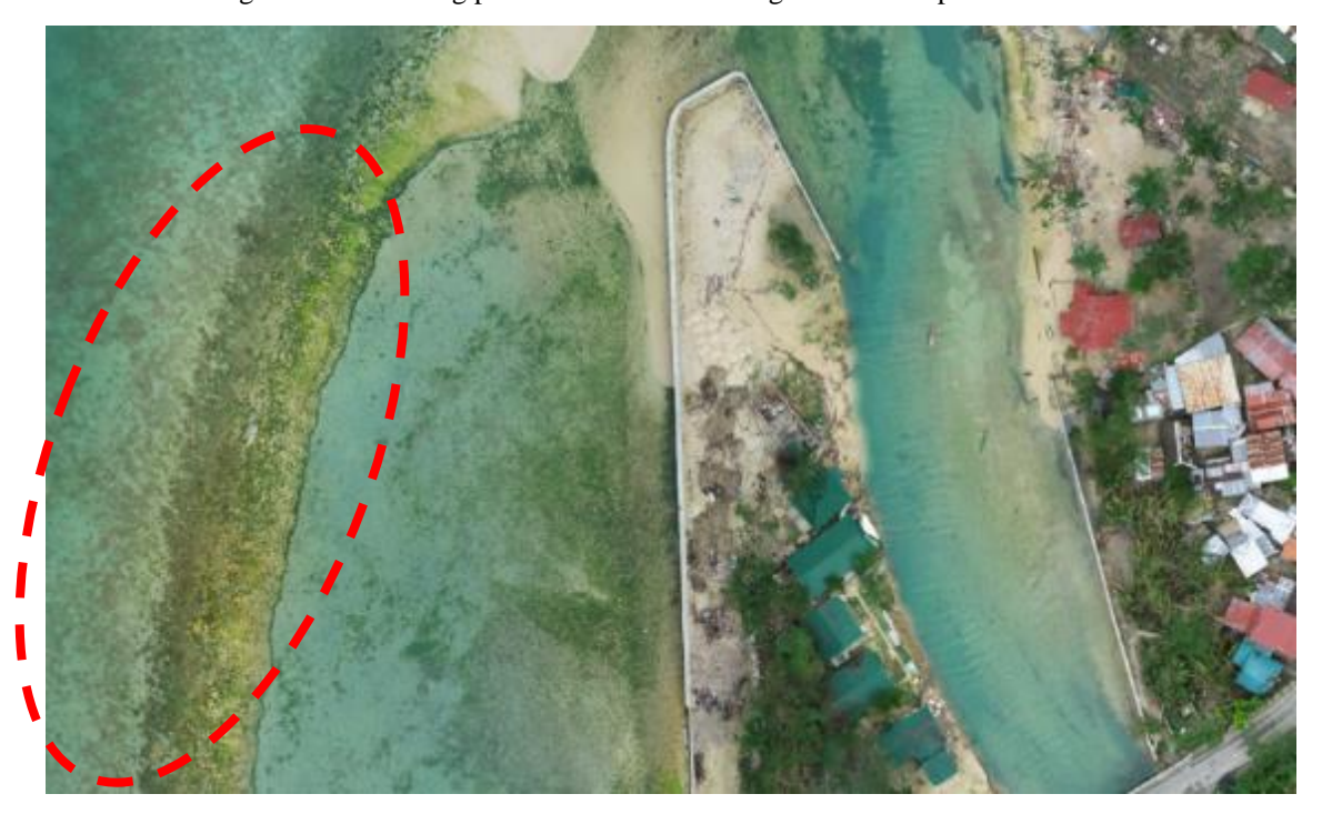
Figure 7. Boulder ridge created by the typhoon offshore Badian (from aerial drone surveys by the authors).

In Badian the coastline in front of Barangay Matutinao was surveyed, which had a seawall that survived the event, although some damage to its top return wall was observed. It was interesting to observe that in this area a boulder ridge had been created by the typhoon, at a distance of ~110 m from the seawall (see Figure 7). According to a local diver these boulders had been taken from the coral slope, from a depth of around 8-9 m. The corals in the area had been almost completely wiped out by the typhoon, which hit at high tide. However, no storm surge was reported in the area, with the observed damage to houses taking place as a result of the high waves and powerful winds.