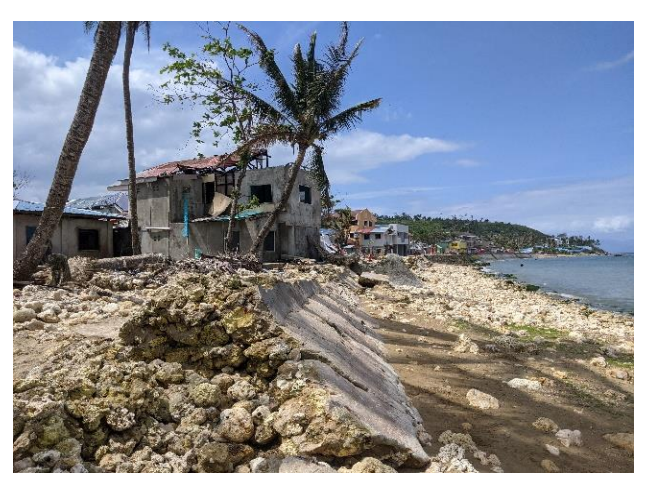
Figure 9. Left. The storm surge reached the top of the seawall in front of Dumanjug market. Right. The storm surge overtopped some of the older seawalls, with scour taking place behind them due to the waves.