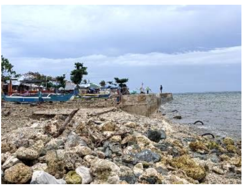
Figure 15. Left. Inundation level in front of the basketball court of barangay Santo Rosario. Right. New (far side of picture) and old (close side of picture) seawall at barangay Tugas.