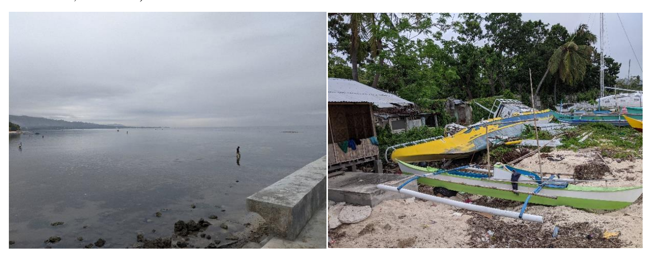
Figure 3. Left. Shallow bathymetry around the port pier of Alcoy. Right. Boats washed onshore by the waves.

The survey started from Cebu City and proceeded southwards to Alcoy town. The town has a small port, around which some small single story holiday cottages are located. The sea in the vicinity of the port is shallow, with a wide reef flat (intertidal area), where local people can walk and gather seafood (see Figure 3). A local resident interviewed indicated that there was no storm surge and that the flood waters they experienced descended from the mountains due to rainfall. The typhoon hit at high tide, with the water reaching the foreshore of the beach, to a level of +0.9 m (according to the resident, the waves reached the entrance of the property, which was about 10 metres from the shoreline). This corresponded to an estimated storm surge of -0.35 m (when the tide at the time of the passage of the typhoon was taken into account, see Table 1).