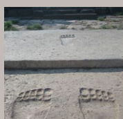
Front cover photo: The footprints of Ain Dara Temple in North Syria.

The relative significance of different factors is difficult to predict, will change over time, and will be determined by refugees' perceptions of their current and future situation. Individual and familial circumstances will likewise change as refugees acquire greater levels of social or economic resources – or find themselves increasingly isolated or affected by precarious situations and poverty. In most instances, onward migration remains impossible, despite high aspirations (wishes, ideas and hopes) to leave.