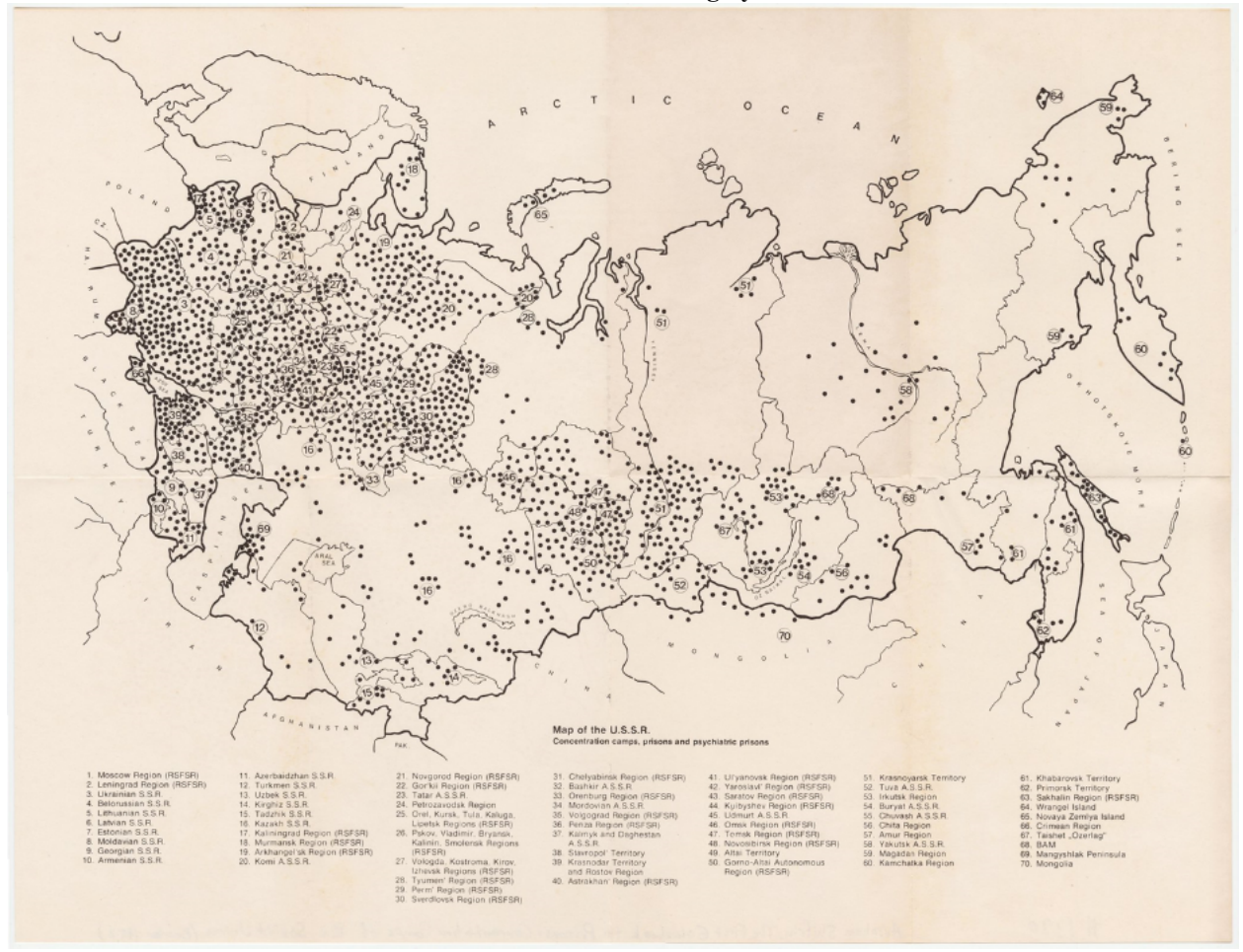
Illustration 1: The Gulag System

Nevertheless, maps produced by the dissident Avraham Shifrin illustrate the reach of the Gulag and suggest how the Communist Party of the Soviet Union drove the expansion of the state right into the lives of workers across the vast territory of the Soviet Union.<sup>18</sup>