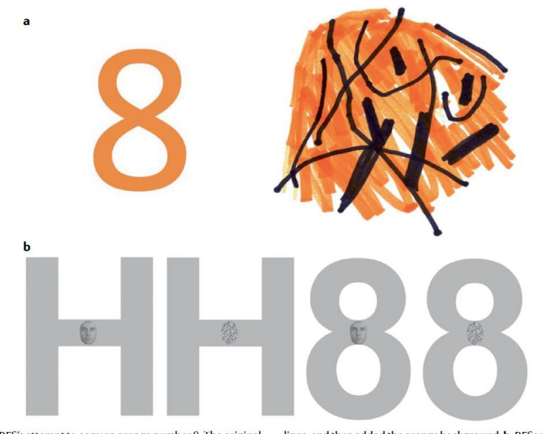
Fig. 1 | RFS case study. a , RFS's attempt to copy an orange number 8. The original stimulus is on the left, and RFS's copy is on the right. RFS was given various pens and markers to choose from to complete the task. He began by drawing the black