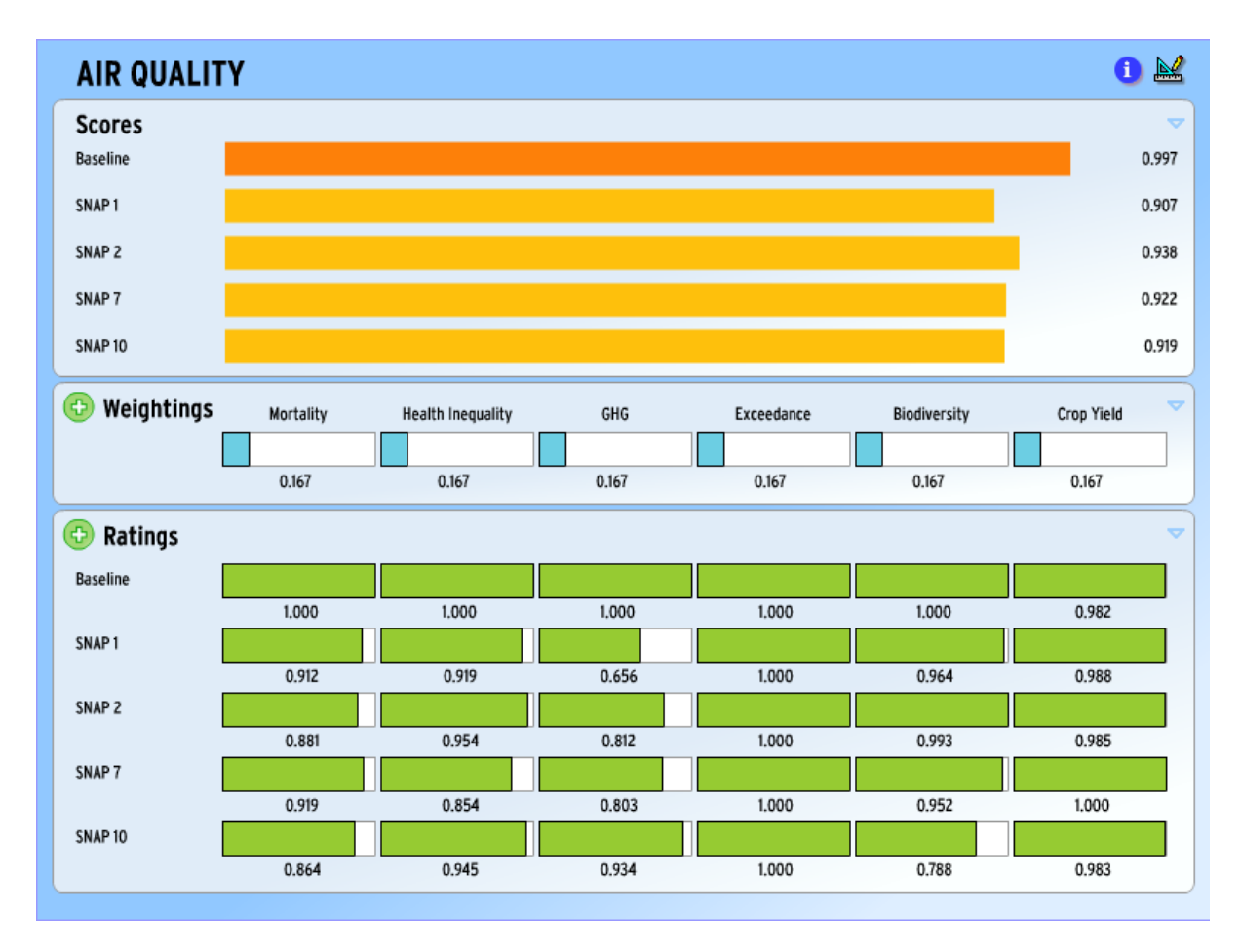
Figure 4. MCDA results with equal weightings.

This shows that reduction in industrial combustion emissions is still the best single policy even if equal weights are assigned to all the criteria.