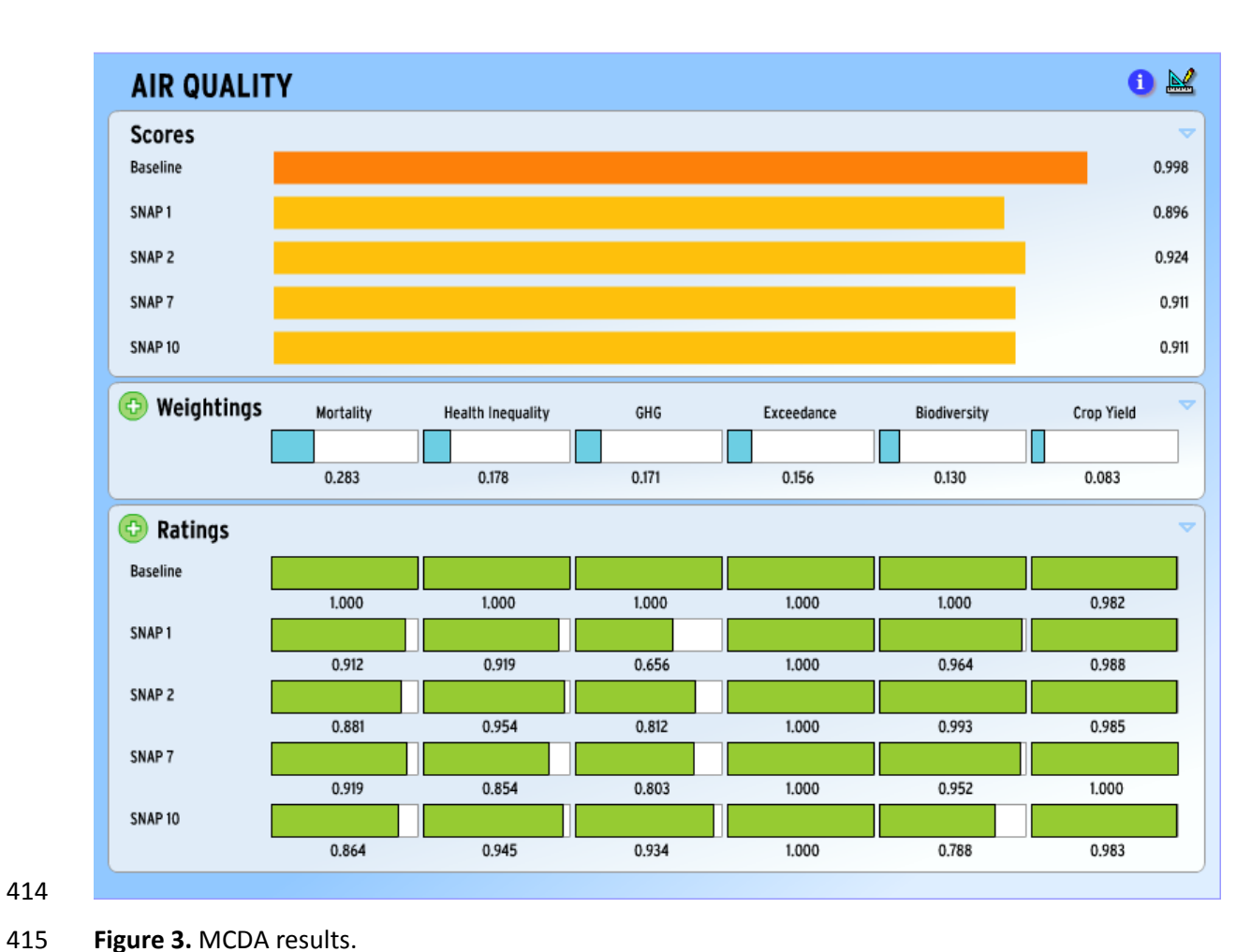
Figure 3. MCDA results.

The total impacts (burdens in this case) for each policy option are obtained by integrating the impacts and the criteria using the calculation method described in Supplementary Material E. The results are shown in Figure 3 using the Annalisa MCDA template: