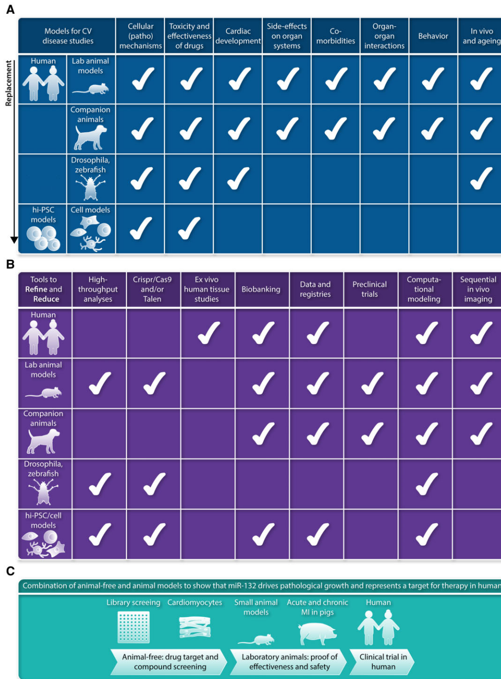
Figure 1 (A) Models that are available for studies on cardiovascular disease, ranging from human and laboratory animals to stem cell-derived models. Aspects that can be measured currently in the different models are indicated with the white check mark. This overview shows that several models allow to reduce the number of studies in laboratory animals, as many initial steps in identification of pathomechanisms, testing drug toxicity and drug effectiveness can be studied in cell-based models. Clearly, studies in human itself offers multiple opportunities to reduce the work in laboratory animals. (B) Multiple tools have been developed in past years to refine and replace studies in the models used for cardiovascular research, and range from tools and expertise to characterize human tissue samples obtained during surgery to models derived from hiPSCs (human induced pluripotent stem cells). (C) Example of an experimental design making use of available complementary research models based on the 3R principles. 2

pathways triggered by the initial cardiac injury. This includes CM remodelling and alteration of metabolism, followed by progressive LV dilatation (eccentric remodelling), associated with extensive remodelling of the