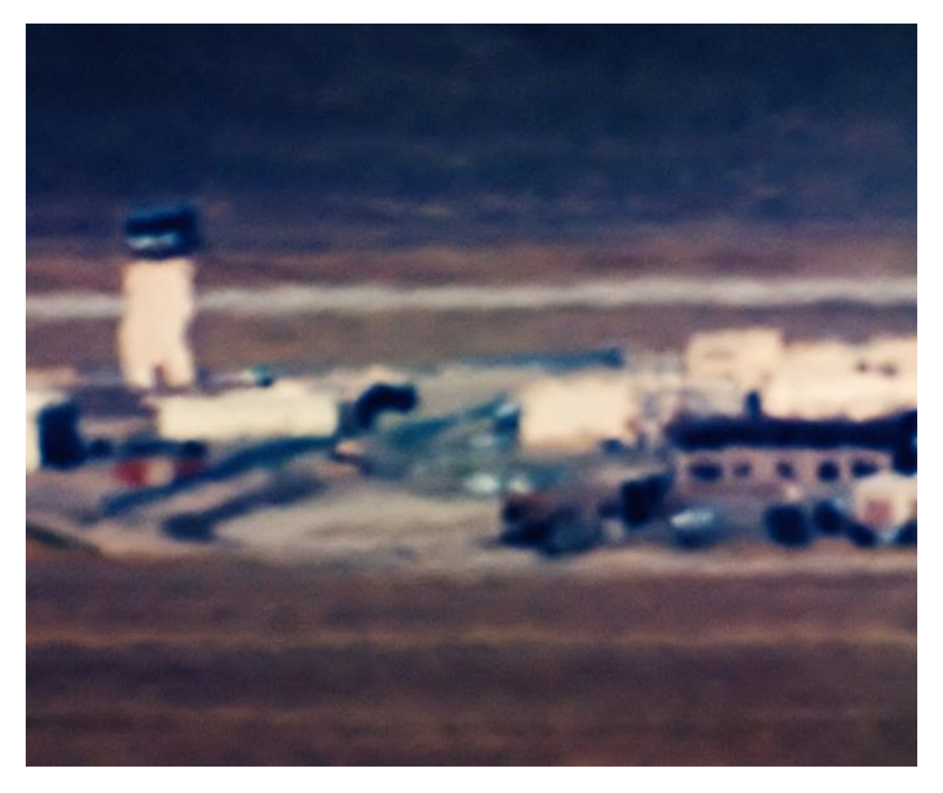
2. Trevor Paglen, Control Tower (Area 52); Tonopah Test Range, NV; Distance ~ 20 miles; 11:55 a.m., 2006.

representation of late capitalist totality.<sup>35</sup> Along similar lines, Lee describes Paglen's work as situating the sublime as a "function of a military-aesthetic complex continuous with the law," which links with Jameson's proposition that cognitive mapping should "enable a situational representation on the part of the individual subject to that vaster and properly unrepresent-able totality which is the ensemble of society's structures as a whole."<sup>36</sup> What I want to do in this next section is push at these arguments, all of which continue to assume that the problem with the sublime lies in its unknowability, and therefore deduce that greater transparency and more information is the solution to that which lies at the edge of sense.