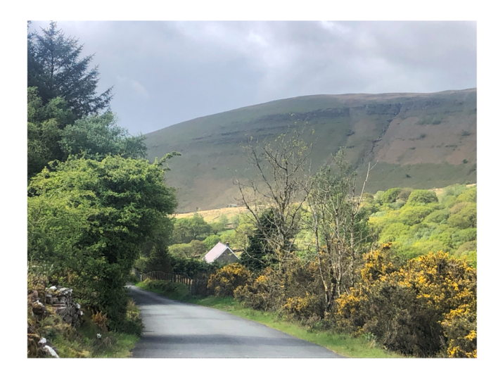
Fig. 5. The Glyntawe landscape with farm buildings, south-western side of the National Park.

change. The Brecon Beacons has fewer second homes than other parts of Wales and is not generally considered a hot-spot for this form of investment. However, the research focused on this type of investment buying and its potential community impacts. The Brecon-based agent, B07, said that he was aware of far more holiday lets in the National Park than second homes, and these were usually owned by local residents. This was confirmed by the housing consultant, B02, who suggested that the owners of 'holiday investment properties' across Wales 'tend to be local people who re-mortgage their homes in order to raise the capital [needed] to buy a house for Airbnb.' It was confirmed that the distinction between second homes and holiday lets is not always clear, as some owners of second homes may at times rent these properties out commercially. However, because of the management requirements of short-letting (making sure a house is clean and ready for new guests), there is a tendency for the owners of holiday lets to live nearby (rather than trusting them entirely to a hosting service). This means that the owners of second homes are generally 'non local' while the owners of holidav lets tend to be 'local'.