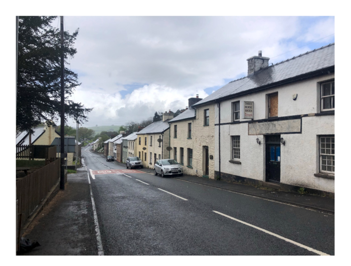
Fig. 4. Trecastle High Street.

Second homes, used mainly or exclusively by the owner and / or family and friends, were mentioned in broader discussions of market