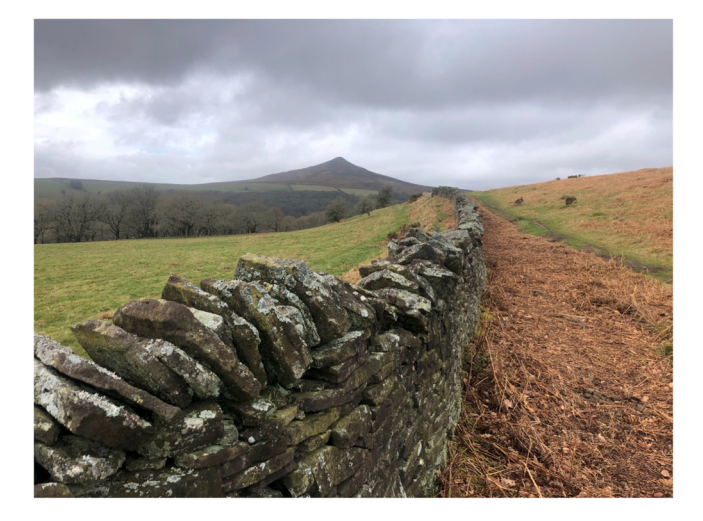
Fig. 2. The Sugar Loaf (Y Fâl), near Abergavenny on the eastern side of the National Park.

occupation-based communities to the west could be particularly sensitive to changes in farm incomes, because of Brexit, and to new pressures on local housing markets, because of the pandemic. National Park Officers are acutely aware of the risks to social cohesion and have been closely following, and often contributing to, policy developments being discussed by the Welsh Parliament in Cardiff. These relate to the local tax treatment of second homes; mandatory licensing for holiday lets; restrictions on non-principal residence - affecting new-build; and bars on the use of primary dwellings as second homes and holiday lets (see Welsh Parliament, 2022). Pandemic-induced demand could unsettle community balance in the west whilst worsening housing affordability in the east. There is a need to understand the issues at stake and, where