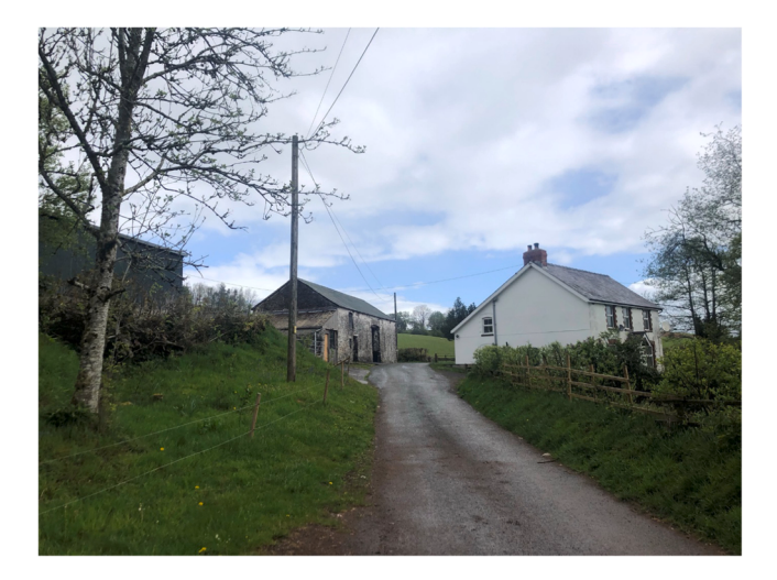
Fig. 3. Farm buildings near Glasfynydd Forest, on the western side of the National Park.

occupation-based communities to the west could be particularly sensitive to changes in farm incomes, because of Brexit, and to new pressures on local housing markets, because of the pandemic. National Park Officers are acutely aware of the risks to social cohesion and have been closely following, and often contributing to, policy developments being discussed by the Welsh Parliament in Cardiff. These relate to the local tax treatment of second homes; mandatory licensing for holiday lets; restrictions on non-principal residence - affecting new-build; and bars on the use of primary dwellings as second homes and holiday lets (see Welsh Parliament, 2022). Pandemic-induced demand could unsettle community balance in the west whilst worsening housing affordability in the east. There is a need to understand the issues at stake and, where