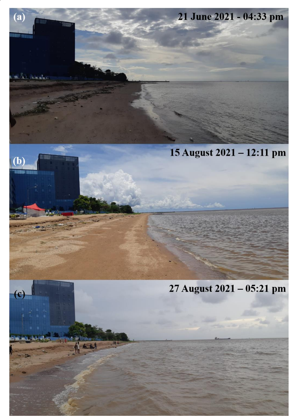
Figure 6 Examples of photos posted by the citizens that demonstrate the capacity of capturing changes in the coastal environment