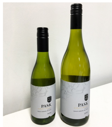
FIGURE 1 Example of wine bottles used in the study (left: 37.5-cl bottle; right: 75-cl bottle) [Color figure can be viewed at wileyonlinelibrary.com ]

The intervention comprised purchasing a given quantity of wine—based on the self-reported volume consumed per household at baseline—in bottles of one of two different sizes, in an order determined by randomization (Figure 1): (i) 37.5 cl and (ii) 75 cl. Study wines for each variety and producer were available in both bottle sizes (see Supporting information, Appendix S2 for the study wine lists).