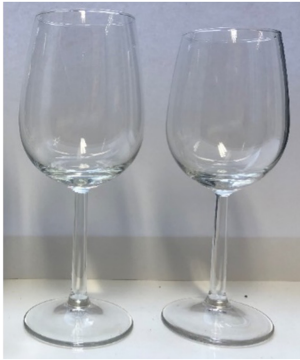
FIGURE 2 Wine glasses used in study (left: 350 ml; right: 290 ml) [Color figure can be viewed at wileyonlinelibrary.com ]

Households were randomized to their first bottle size condition, i.e. to first purchase wine in either 75- or 37.5-cl bottles. Representatives were asked to select the wines they would like to receive for the first intervention period. They were then redirected to the retailer's website with instructions to purchase their preferred wine in the allocated bottle size, in quantities based on 3 weeks' typical self-reported consumption. The amounts were fixed during both intervention periods. Representatives sent their order confirmation to the research team.