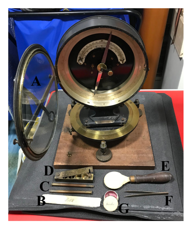
Figure 3. Fox's dipping needle and experimental apparatus. The glass cover (A) to the circle can be closed in bad weather, but still allow observations. In the foreground, clockwise from the bottom left, is a packet of silk (B), two deflectors (C), a brass tin containing various weights (D), a wooden-handled ivory disc (E), tweezers (F) for attaching weights, and a pot of 'hooks' (G) to suspend the weights from the silk. (Online version in colour.)

the production of magnetic knowledge, that we attempted to implement during our reworking of this experimental enterprise.