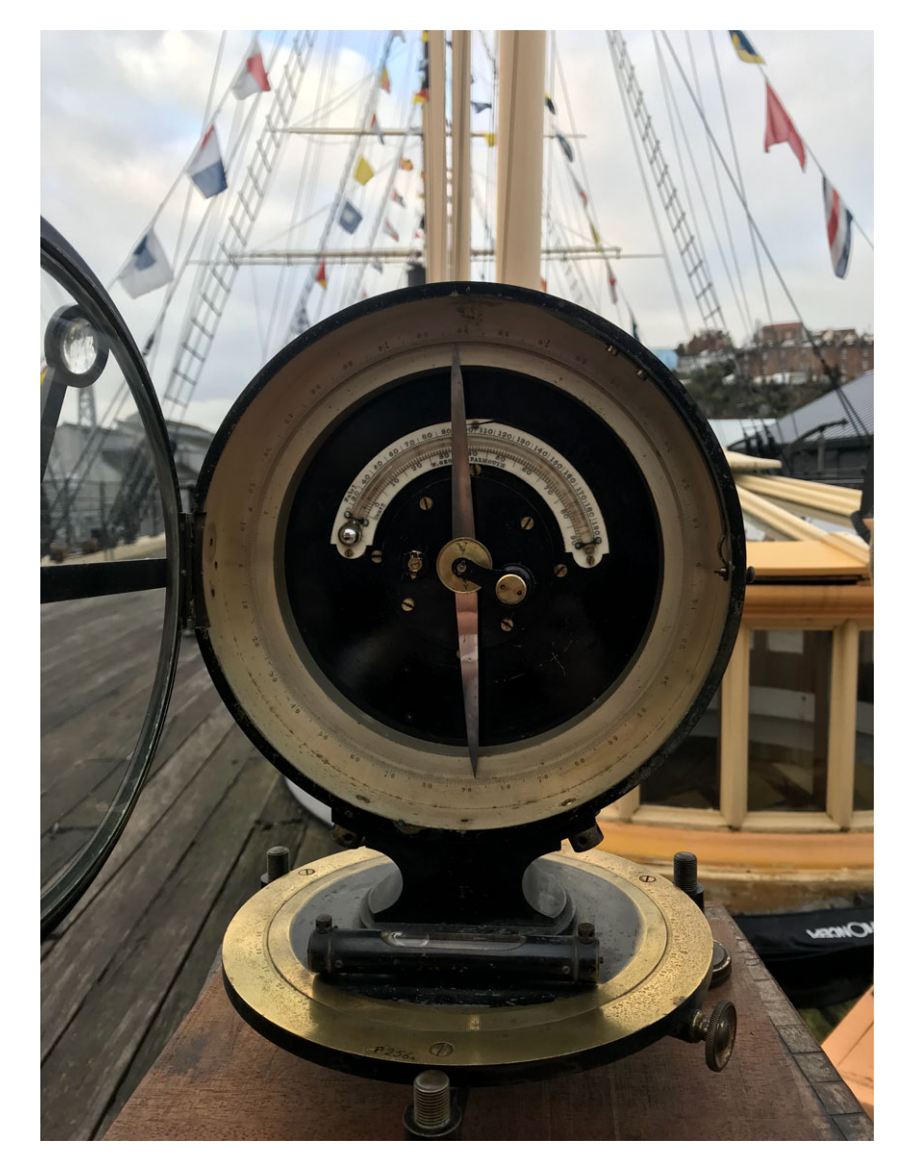
Figure 4. The Fox type on board the SS Great Britain , with the magnetic needle pulled straight down at almost 90°, which erroneously indicated our position being close to the North Magnetic Pole. (Online version in colour.)

Marco Polo was due to follow our intended route from England to Cape Town, via Cape Verde and St Helena, which was similar to Ross's course en route to Hobart and Antarctica between late 1839 and 1841. His journey included stops at Tenerife and Madeira before reaching St Helena, but we could find no company that was replicating this precise voyage. Overall, the Marco Polo was the most historically accurate option open to us. On board the ship, we identified the deck furthest astern as the most suitable for magnetic experiments. Though there was potential disturbance from the taffrail, this site aft was decked in wood and provisioned with a high wooden table to give distance between