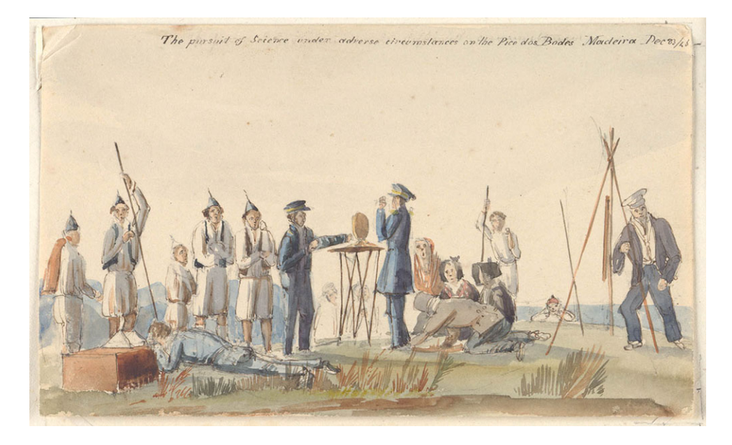
Figure 8. Owen Stanley's depiction of Dayman performing a magnetic experiment with a Fox type on Madeira, as part of the Rattlesnake expedition. (Online version in colour.)

due to the ship's iron, but to local interference, asserting that the 'observations on board the ship at this station are the nearest to the truth, there being much iron-stone strewed over the country about the observation spot on shore'.<sup>39</sup> Clearly, nineteenth-century expeditions did not have to contend with the disturbing magnetic influence of modern harbour installations, but the potential of a ship to provide a controlled magnetic environment was something that appealed both to nineteenth- and to twenty-first-century experimentalists.