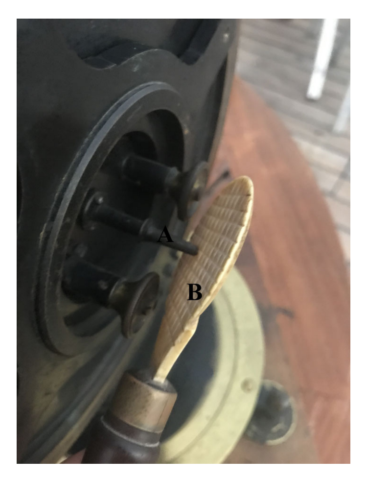
Figure 9. Vibrating the pin (A) at the rear of the circle with the ivory disc (B), which in turn vibrates the needle, encouraging an easy oscillation and accurate measure of dip. (Online version in colour.)

forthcoming break: reinserting the needle was a silent process, with the experimentalist ever listening for the dreaded crack of snapping pivots. I am pleased to say that this sound was one we never encountered. But in this task, sight was of a very limited value compared with touch and hearing.