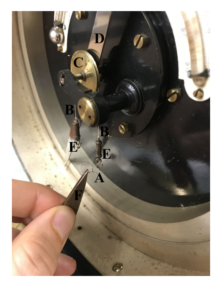
Figure 7. The performance of an intensity experiment with weights (A), underway at East London, with silk thread (B) wound around the grooved wheel (C) that is fixed to the needle (D). This thread suspends two hooks (E) to which weights are added with tweezers (F), so as to coerce the needle back to its dip. (Online version in colour.)

nearby railway lines. However, our purpose here was to trial the weights. After recording the dip, we inserted deflector 'S', which deflected the needle to 72^{\circ}9'59'' . Next, we affixed a thread around the needle's grooved wheel, suspending hooks to which the tiny weights were added to coerce the needle from its deflected dip, back to 65^{\circ}24'55'' . Adding the weights gradually, it took a total of a fifth of a grain to restore the original measure, though it was hard to be precise owing to the thread's tendency to slip within the grooved wheel (figure 7). To confirm the high influence of the harbour's local iron, we took dip measurements back on the ship, giving a mean of 13^{\circ}49'5'' , which was more consistent with readings taken at Cape Town.