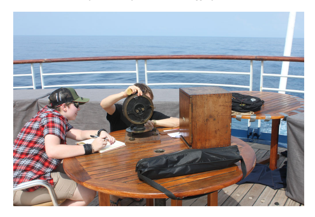
Figure 5. A magnetic experiment underway at the stern of the Marco Polo . (Photo: Crosbie Smith, 2020.) (Online version in colour.)

the instrument and the ship's superstructure (figure 5). Wooden ships such as Terror and Erebus did not face this problem of a metal hull. However, the Marco Polo was partially rebuilt during the early 1990s, with much of the upper portions of the vessel constructed with non-magnetic aluminium. Within the limits of affordable twenty-first-century ocean travel, these conditions were the most historically realistic we could attain.