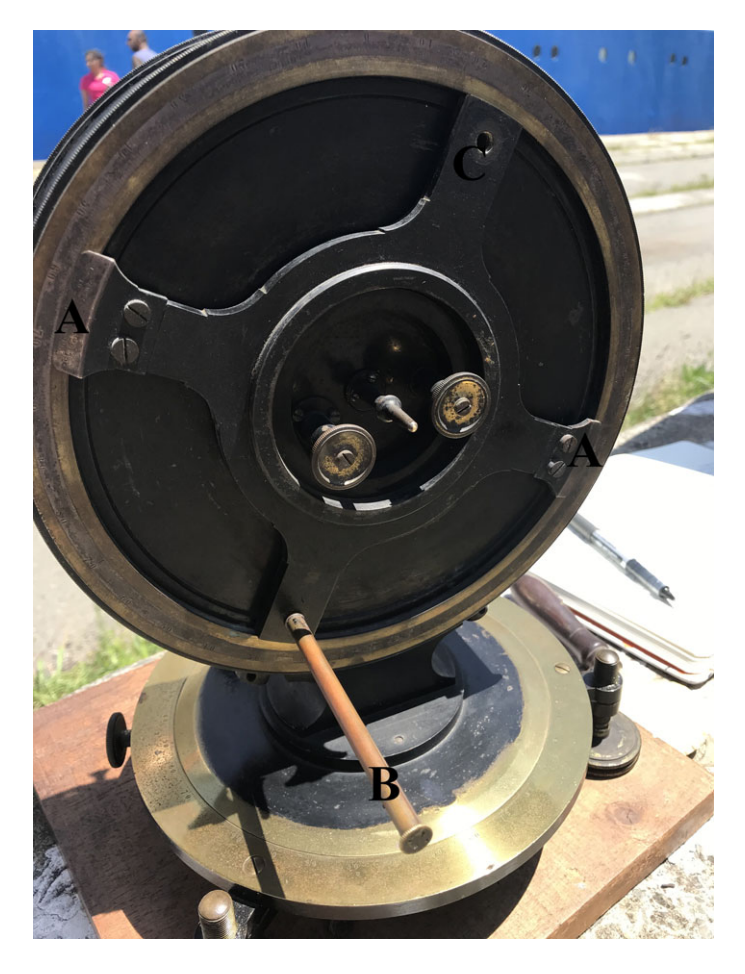
Figure 6. The reverse of the circle. A dial (A) can be moved around the circumference's vernier, adjusted in reference to the dip measured to maintain a constant difference between the needle at dip and the deflectors. The deflectors are screwed into holes. In this image, deflector 'S' (B) has been inserted, while the hole for deflector 'N' (C) is open. (Online version in colour.)

magnetic force as we neared the South Magnetic Pole. Unfortunately, bad light, salt spray, and a rolling sea limited our experimental observations to just three and compromised the accuracy of this series. While our voyage was essentially complete, we were still keen to try the weights in an intensity experiment. At sea, we failed to acquire the skill to attach the tiny weights to the delicate hooks. However, on reaching the quiet port of East London, and encountering a complete absence of wind, with warm, dry conditions, we disembarked and performed intensity experiments on the harbour-side. These attracted a crowd of dockers and great enthusiasm from the port's security workers, who seemed to enjoy the spectacle the instrument presented. Less welcome was the large number of ants we encountered on the site of our experiments. We took initial dip readings, providing a mean of 65°24′55″. This value was arbitrary and far too high to be reliable, owing to the high proportion of iron in the surrounding vicinity, particularly in the harbour's structure and a dense network of