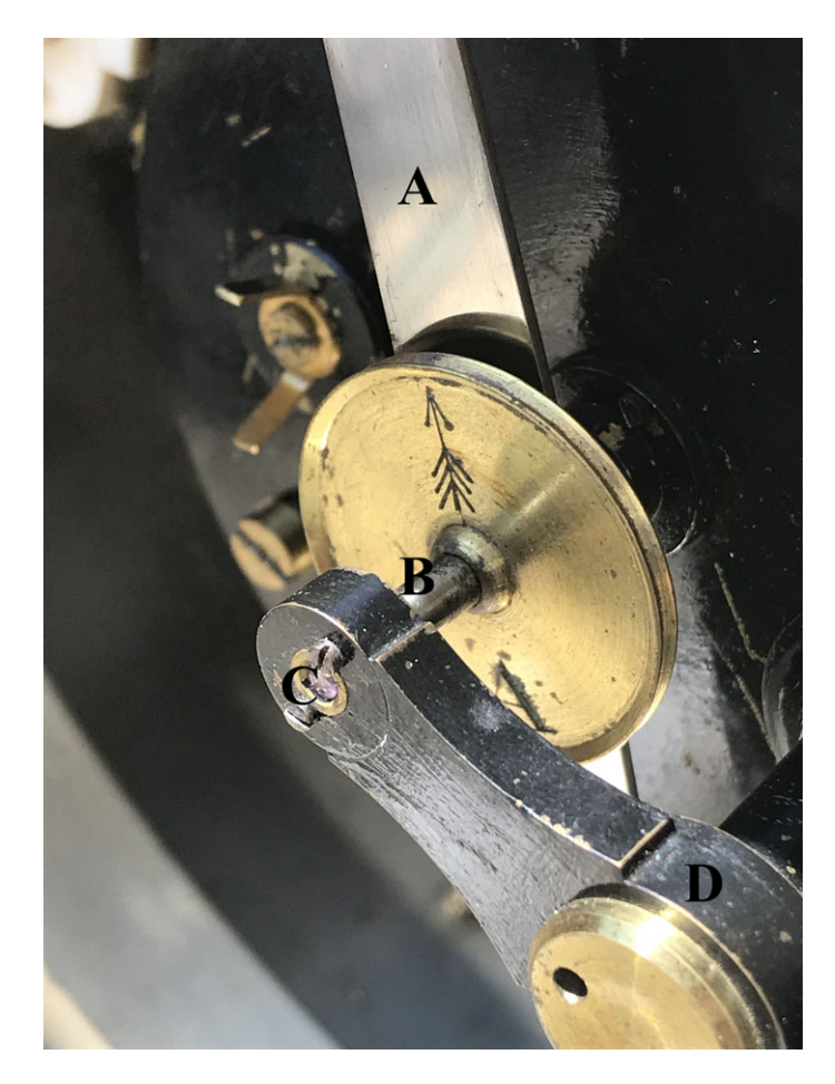
Figure 1. The magnetic needle (A) of the Royal Cornwall Polytechnic Society's Fox type, suspended by its pivots (B) between jewelled pallets. The outer jewel (C) is held within an arm, attached to an axle (D) which connects it to the circle's face. (Online version in colour.)

as 'deflectors'.<sup>22</sup> After attaining the dip by directing the needle towards the Magnetic North Pole and recording the angles given, the dial on the circle's rear could be lined up to correspond with the angle of dip, before the deflectors were screwed into the back of the instrument. This magnetic impulse repelled the needle and, by adjusting a movable disc around the rear of the device, could be applied at a regular angle of 30° from the dip initially indicated, so as to ensure that the position of this influence was consistent.<sup>23</sup> The difference in degrees between dip and deflection provided measures of intensity. At this point, for a more accurate experimental result, weights could be used to weigh the Earth's magnetic intensity. By opening the circle's glass cover, a silk thread was looped around the needle's grooved wheel and hooks attached to the thread. Weights would then be added to coerce the needle from its angle of deflection back to its angle of dip. With the