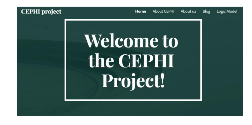
Handling Complexity in Evidence from systematic reviews and meta-analyses of Public Health Interventions (CEPHI project)