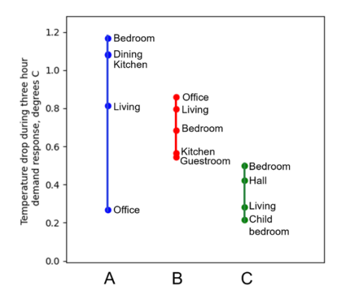
Fig 1. Average air temperature drop during the peak period (4pm-7pm)

It can be observed that the air temperature did not drop equally across different rooms in each house (see Fig. 1). House A had the greatest heterogeneity in the rate of temperature change across the house. That is because one of the rooms, the office, was not heated and therefore its temperature was less affected by reducing the setpoint temperature (only 0.25°C). If we omit this room from the analysis, there was a similar heterogeneity in the temperature drop between the studied rooms within the three cases: approximately 0.3°C.