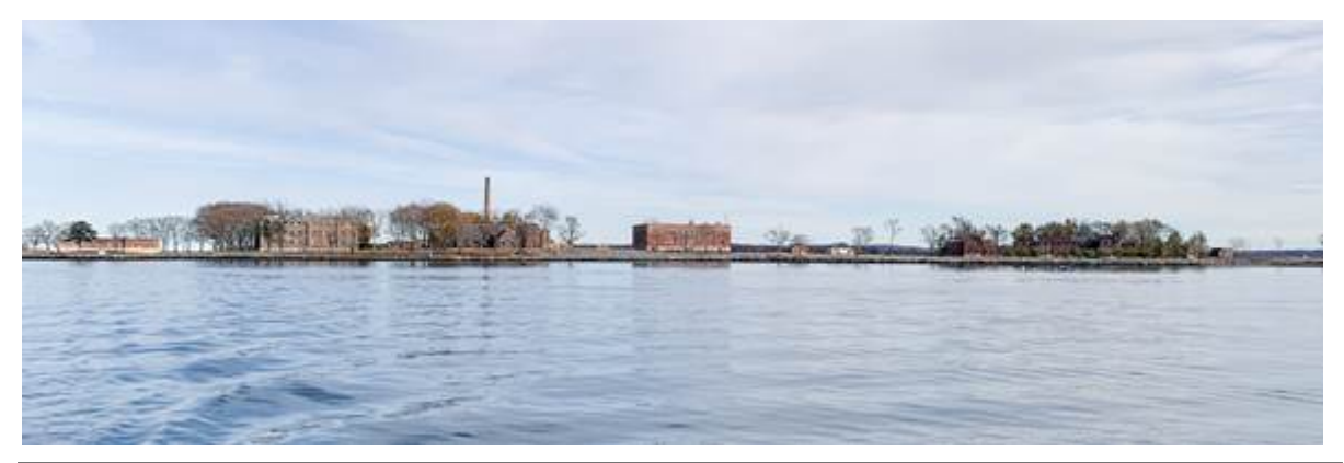
Figure 3. View of the remaining Hart Island buildings from City Island, 2021

neither have to see nor contemplate their existence.<sup>13</sup> Therefore, when it came to choosing yet another new site for a potter's field in the 1860s, the city turned its attention to Hart Island, a small land mass in what is now the north-east Bronx. Formerly used as a civil war training camp, it was purchased by the Department of Charities and Corrections in 1869 for $75,000.<sup>14</sup> Along with the grid cemetery for mass grave trenches, a number of penitentiary institutions were established here, such as a psychiatric hospital and a workhouse for delinquent boys (Figure 3).