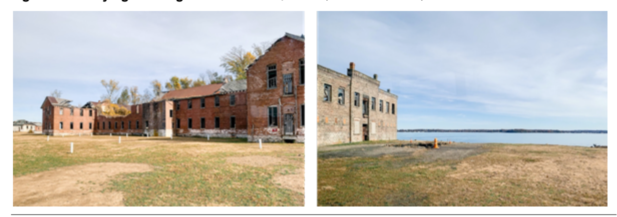
Figure 8. Decaying buildings on Hart Island, 2021

Flooding and shore erosion are also key environmental concerns, with significant damage caused by intense storms and a lack of adequate protection (Figure 9). Not only does this affect the environment of the island, it has also led to remains being brought to the surface or washed away, and in some cases eventually landing on nearby City Island.<sup>50</sup> This disinterment by storm damage is not only traumatic for those involved, but also signals a disrespect and lack of adequate care for the proper burial of remains by those tasked with doing so, a lack of care that erodes trust in the city's ability to respectfully and competently manage the burial function of the island. Therefore, it is critical that protections are put in place to ensure that Hart Island is not at risk. For this, there is already an existing model in the environmental restoration project at Jamaica Bay that began in 2021.<sup>51</sup> These methods, which include developing a resilient living shoreline in order to ensure natural erosion control and restoring the native plant community to encourage migrating birds, could be adapted for use on Hart Island.