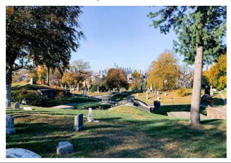
Figure 6. View from Green-Wood Cemetery, 2021

Unlike Hart Island, Green-Wood is a privately owned cemetery, originally designed along a business model whereby plots could be purchased and owned in perpetuity, at a price that was also intended to fund their upkeep. However, as burial plots become increasingly scarce, paid events and memberships are used to fund the maintenance of the cemetery as operating costs rise beyond the income generated by plot purchases.<sup>45</sup> Furthermore, although it was utilised in a similar function to park space since its inception, Green-Wood's current educational mission only emerged in 1999, following the establishment of the Green-Wood Cemetery Historic Fund. As a result of its multifunctional, rural cemetery origins, adapting the wider public perception of Green-Wood to allow for mixed recreational activities – although critics do remain – was significantly less challenging than the reputational obstacles faced by Hart Island. However, it can and should be considered as a useful model for a dignified, multifunctional cemetery that can serve both the dead and the living, and one that has successfully utilised public support, membership and heritage tours to fund educational endeavours.