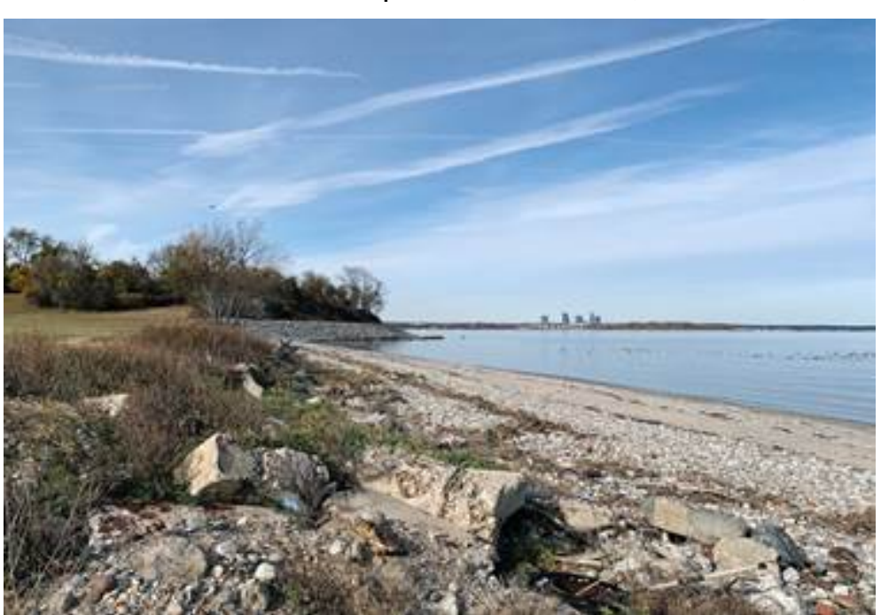
Figure 9. Shoreline on the north-western tip of Hart Island, 2021

Flooding and shore erosion are also key environmental concerns, with significant damage caused by intense storms and a lack of adequate protection (Figure 9). Not only does this affect the environment of the island, it has also led to remains being brought to the surface or washed away, and in some cases eventually landing on nearby City Island.<sup>50</sup> This disinterment by storm damage is not only traumatic for those involved, but also signals a disrespect and lack of adequate care for the proper burial of remains by those tasked with doing so, a lack of care that erodes trust in the city's ability to respectfully and competently manage the burial function of the island. Therefore, it is critical that protections are put in place to ensure that Hart Island is not at risk. For this, there is already an existing model in the environmental restoration project at Jamaica Bay that began in 2021.<sup>51</sup> These methods, which include developing a resilient living shoreline in order to ensure natural erosion control and restoring the native plant community to encourage migrating birds, could be adapted for use on Hart Island.