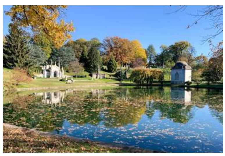
Figure 4. Green-Wood Cemetery, 2021

hailed as a prime example of an appropriately dignified final resting place (Figure 4). As a journalist neatly summarised in 1866, 'it is the ambition of the New Yorker to live upon the Fifth Avenue, to take his airings in the Park, and to sleep with his fathers in Green-Wood'.<sup>30</sup> Crucially, in order to reinforce social distinctions; regulations ensured that no citizen who had been convicted of a crime or had died in prison could be buried there, although these rules could be waived through money, influence or politics. This was demonstrated by the approved burial of the powerful Tammany Hall leader, William 'Boss' Tweed, a notorious politician and major landowner who was convicted of financial fraud and died in Ludlow Street Jail in 1878.