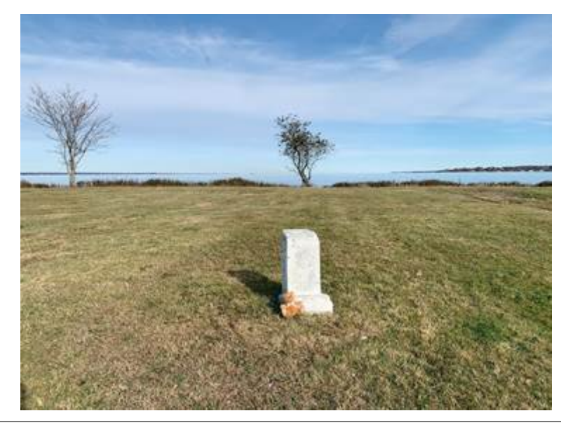
Figure 5. Hart Island, 2021

approved in 2021, it is in fact not only merely the poorest and most marginalised members of society who leave their loved ones' remains in the hands of the municipality.<sup>35</sup> Their deaths, and their memory, should not be shrouded in shame – nor be emphasised as such in the media.