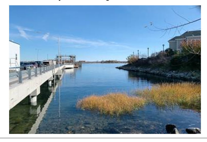
Figure 7. View of the dock on City Island, looking towards Hart Island, 2021

a group of mothers of children interred on the island.<sup>48</sup> Furthermore, access is complex and limited, as visitors must travel to the dock on City Island in order to access the Hart Island ferry (Figure 7). For those using public transport, this usually involves a subway journey to Pelham Park Bay, before taking an infrequent bus to a stop within walking distance of the dock. Following a 5–10-minute ferry ride from nearby City Island, visitors are then taken directly to a bus from the dock and escorted to their specific gravesite. Depending on the schedule and location of the grave they may remain for up to an hour before boarding the bus to return to the ferry.