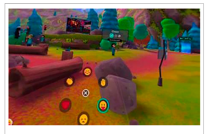
FIGURE 2 | Ray casting in AltSpaceVR.

To avoid the overlapping of avatars, some platforms use a bubble mechanism to make the avatar transparent when in close proximity, though this also hinders interpersonal interactions. In trials, most of the participants would have liked to pat someone's head, but the bubble hindered this by making the