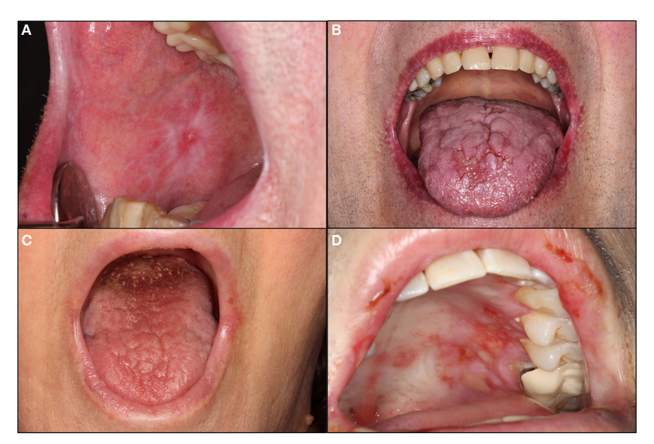
FIGURE 2 Oral mucosal and salivary immune related adverse events (irAEs). (A,B) demonstrate oral lichen planus-like irAEs characterized by white striations of the right buccal mucosa with a central pinpoint ulceration and surrounding erythema (A) and generalized erythema of the upper and lower lip vermilion with atrophy, white changes, and coalescing ulceration of the midline anterior dorsal tongue with surrounding erythema (HSV-negative; B). (C) demonstrates a Sjögren syndrome-like irAE with desiccated oral mucosa and loss of filiform papillae of the dorsal tongue. (D) demonstrates a mucous membrane pemphigoid irAE characterized by scattered ulcerations of the hard palatal mucosa and upper lip mucosa with significant surrounding erythema (HSV-negative).

observed at the basement membrane zone without specific reactivity to immunoglobulins [20]. ELISA is negative to antidesmoglein-1 (Dsg-1), antidesmogelin-3 (Dsg3), and anti-BP180 (BP180) antibodies [33]. There are no published oral mucosal histopathology findings in BP irAEs, but skin immunofluorescence studies reveal linear deposition of IgG and C3 at the dermo-epidermal junction and positive serologic titers to BP180 [21, 34]. Features of MMP include subepithelial clefting with preservation of the basal layer of epithelium and a mixed perivascular inflammatory infiltrate on histopathology and linear deposits reactive to IgG, IgA, and C3 on DIF [23, 35]. Approximately half of MMP irAE cases are positive for BP180 [23, 35]. Histopathologic and immunofluorescent findings in EM-like irAEs are non-specific and include a mixed inflammatory infiltrate and no specific reactivity [36]. In such cases, the absence of findings is itself revealing. Oral lesions of SJS and TEN will similarly reveal non-specific ulceration and inflammation [37]. Among any of these conditions, overlapping histopathologic features are possible.