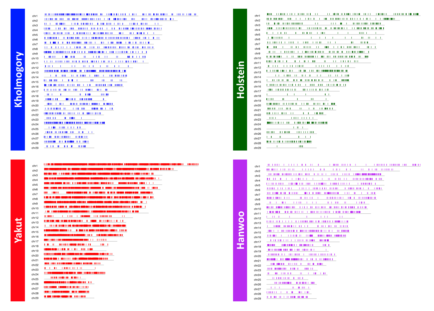
Figure 1. Whole genome distribution of breed-specific CNVRs for the four breeds.