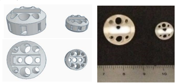
Figure 2. Designed Carousel (Left) and Microwave (Middle) devices and their final 3D Printed congeners (Right).

To demonstrate the utility of 3D printing, we wanted to design stirring devices that could be used in a parallel synthesis apparatus. Our approach involved modification of our original design so that it could be used in both round bottomed flasks and in a Radlevs Carousel multi-tube reactor, 19 where reactions could be conducted in multiple test tubes, with stirring taking place at the edge of the stirrer hot plate. As well as changing external dimensions of the stirring device, we needed to use a rare earth magnetic flea to ensure efficient stirring due to the weaker magnetic force observed at the edge of the stirrer hotplate. The stirrer used for microwave reactions was simply scaled down to an appropriate size to fit the reaction vessel. The designs and 3D Printed devices are shown (Figure 2).