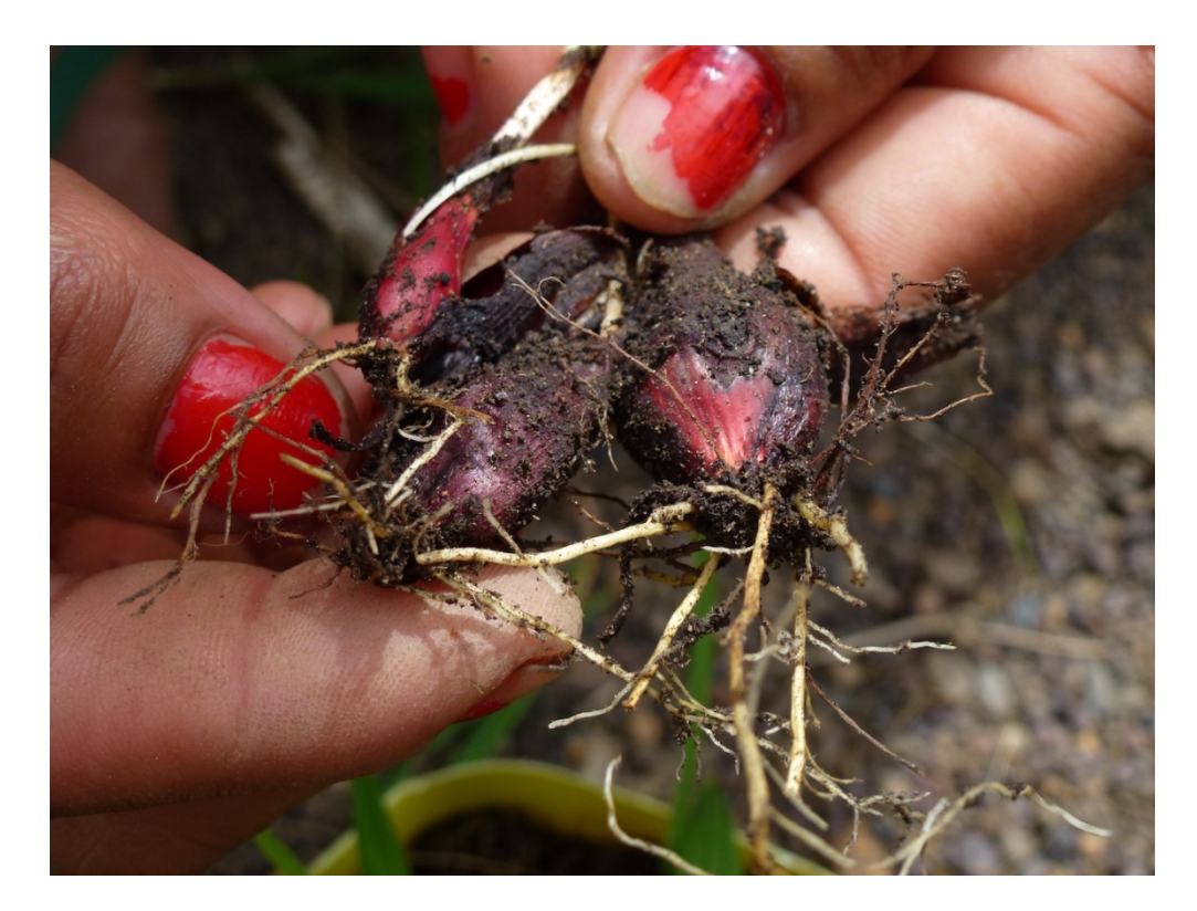
Figure 3. "The Makushi category of 'charm plants' (bina) revealed unexpected synergies between their phytochemistry and the phenomena of shamanism (piai) and necromancy (kanaima)."