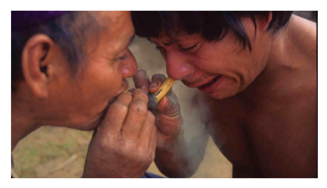
Figure 2. "The more painful the tobacco, the more powerful the shaman." 965x527mm~(72~x~72~DPI)