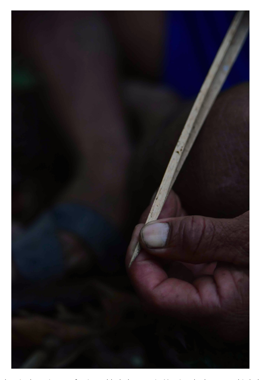
Figure 1. "Bamboo is the epitome of pain and lethal power in Matsigenka botany, whittled to razor sharp points for arrowheads."