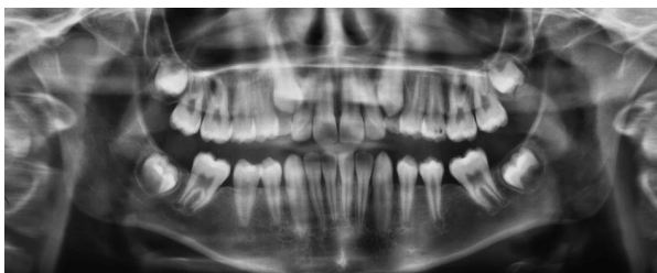
Figure 3. T2 post-extraction example.