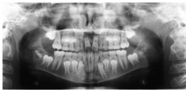
Figure 5. T2 non-extraction example.