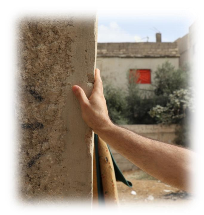
Touching a wall in Irbid camp, Jordan, a wall which resembles the original walls of Baddawi camp, Lebanon

These examples demonstrate the complex relationships that exists between different displacement-affected localities. These are defined by personal, familial, emotional, economic, and political ties that make it difficult to view the responses taking place in such localities in isolation.