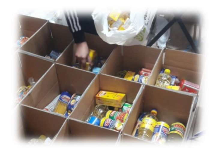
Members of the Baddawi Camp Cultural Club prepare food baskets for camp residents in response to Covid-19.

Indeed, our research highlights how tensions arise in local communities because of UN and NGO responses that make distinctions and prioritise one group over another. For example, the provision of food vouchers to Syrians in urban refugee camps by the World Food Programme meant that other refugees living in the same space were side-lined, such as Palestinians, Iraqis and Kurds.xvii The initiative also disrupted the local camp economy, since the vouchers could only be spent outside of the camp, rather than inside of it. Despite having shared needs as residents of an urban camp, a hierarchy emerged between different groups that created tensions between inhabitants. Recognising that such tensions are not inevitable, including by adopting a relational approach, offers a way for humanitarian support to address rather than compound structural inequalities, including those created by different policies and programmes. This, in turn, will lead to more equitable and sustainable interventions for people affected by, and responding to, displacement.