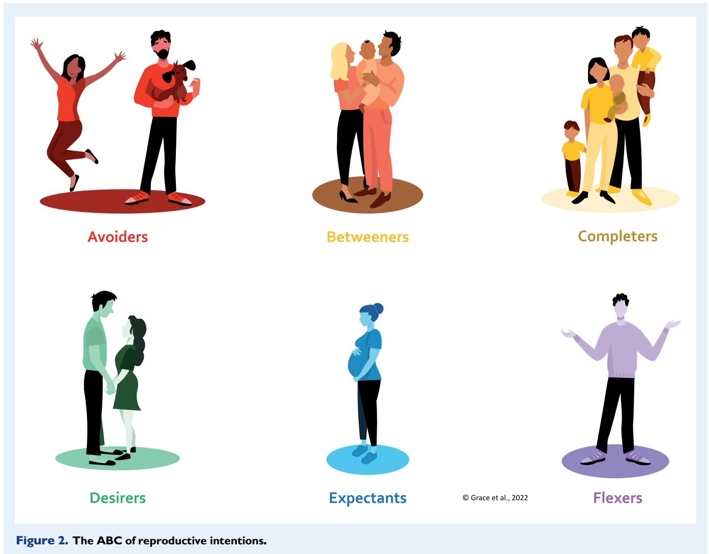
Figure 2. The ABC of reproductive intentions.

graduates and non-graduates. They felt that the timing was important in order to try for a baby. In order to plan for pregnancy, they were talking to their healthcare professionals, taking the right vitamins, taking care of their health, and timing conception to maximize chances.